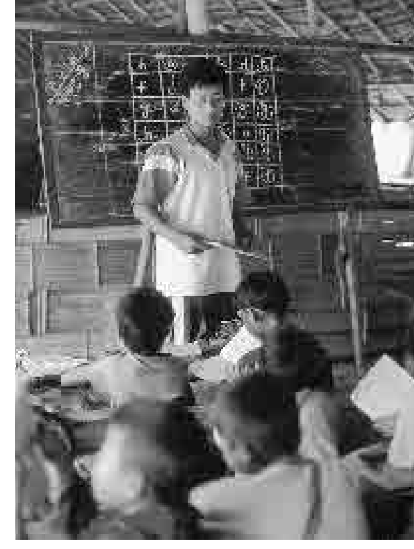
Thailand: Karen refugee children from Myanmar attend school.

In Japan and the Republic of Korea UNHCR will promote public information and fund raising activities in support of UNHCR programmes and the improvement of asylum systems and international protection. The Office will also provide protection and assistance to the small urban refugee population. The Regional Training Centre for International Humanitarian Response will continue