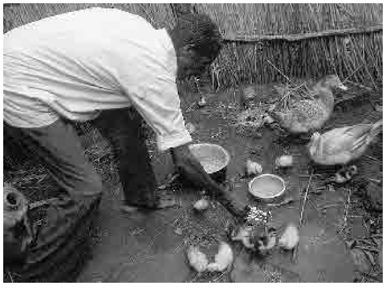
Many of the refugees from Rwanda, Burundi, the DRC, Somalia and Ethiopia are encouraged to engage in income generation activities. Duck keeping in Mkugwa camp.

UNHCR's protection staff will continue to concentrate their training and promotion efforts on refugee rights and legal procedures relating to