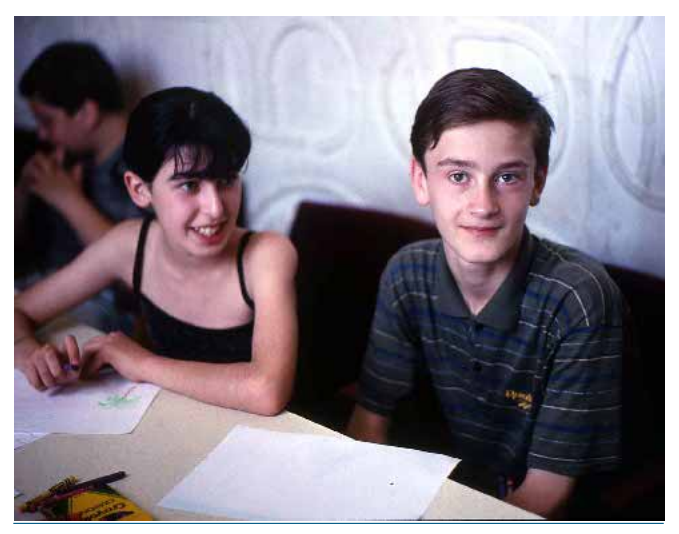
IDPs from Abkhazia. UNHCR renovated a room in the Communal "Academy of Science", a hostel for women and children.

threats against international and national staff and brought about a series of suspensions of UNHCR assistance delivery. Protests resumed in December and continued until the end of the year.