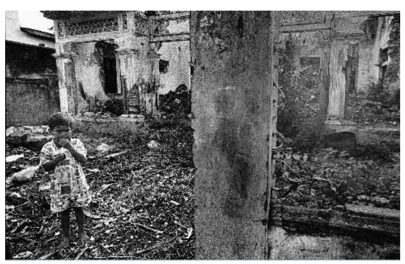
Sri Lanka: IDP returnees in the Muslim quarter, where nothing escaped the ravages of war.

Emergency and security management remained priorities for UNHCR throughout 2002. The Emergency and Security Service (ESS) continued its efforts