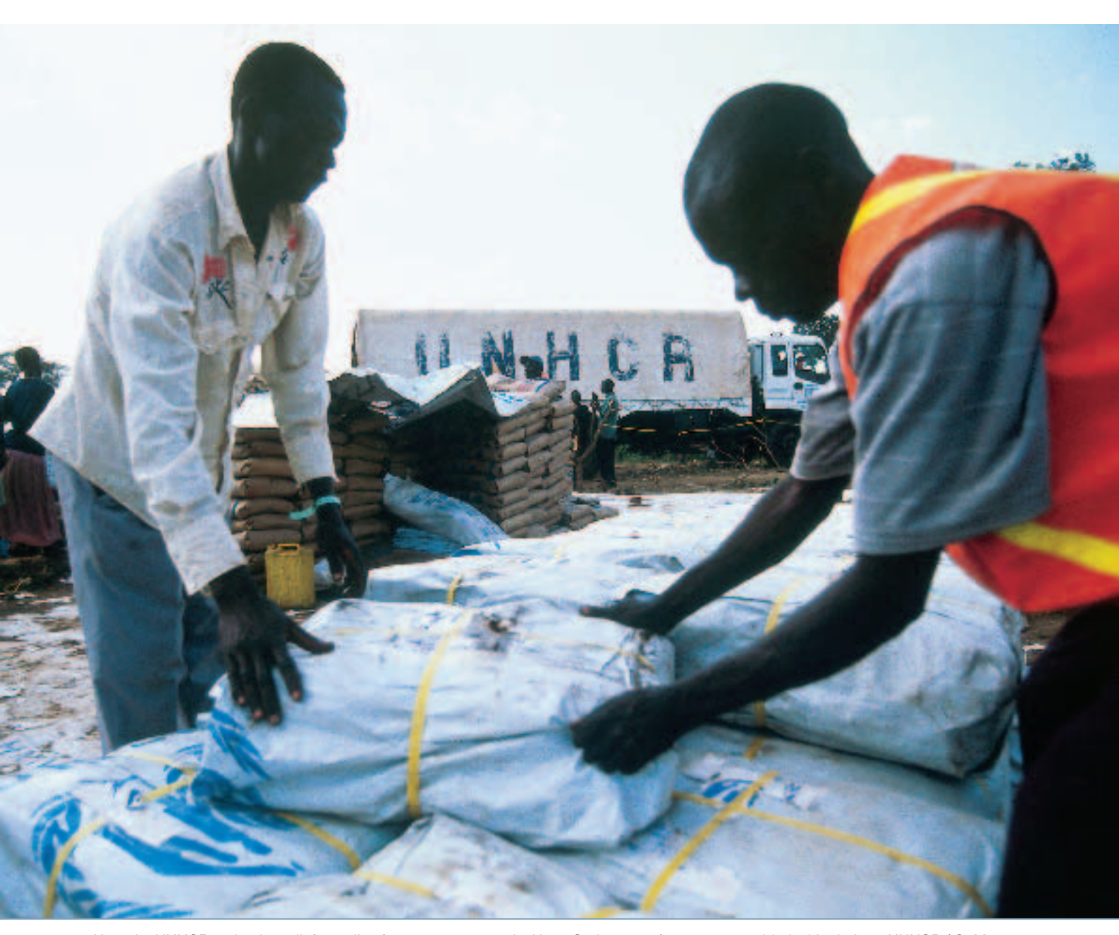
Uganda: UNHCR maintains relief supplies for emergency needs. Here, Sudanese refugees are provided with clothes.

Through its emergency-related projects, UNHCR maintained relief supplies (kitchen sets, blankets, plastic sheeting, jerry cans) for 250,000 persons at its Central Emergency Stockpile (CES) in Copenhagen.