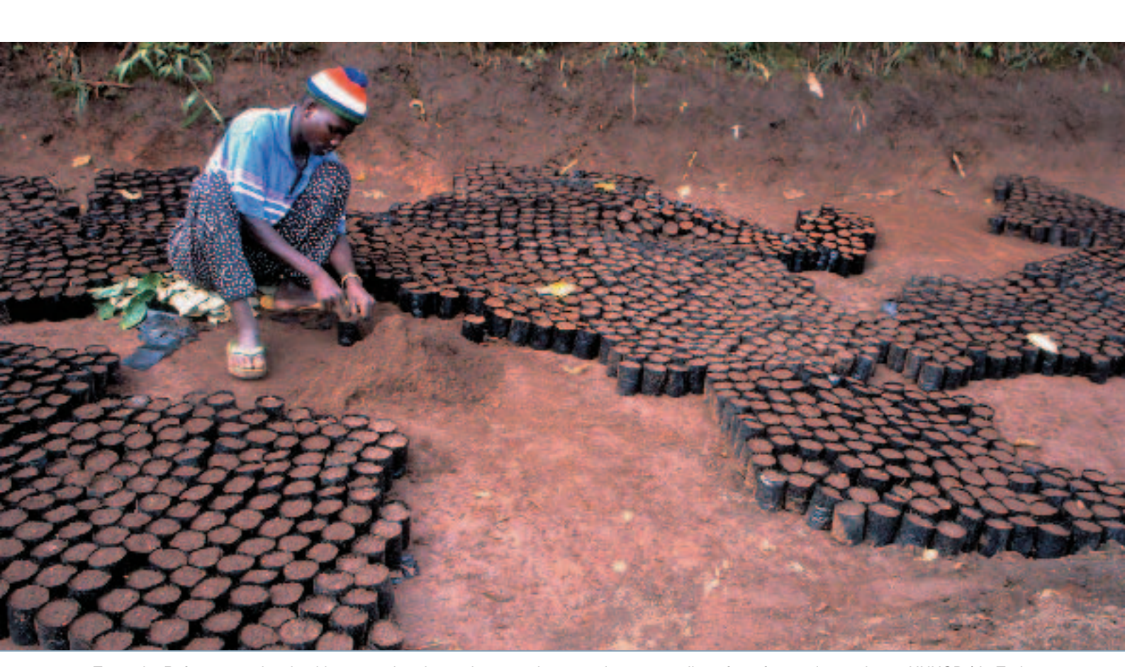
Tanzania: Refugees are involved in preserving the environment by preparing tree saplings for reforestation projects.