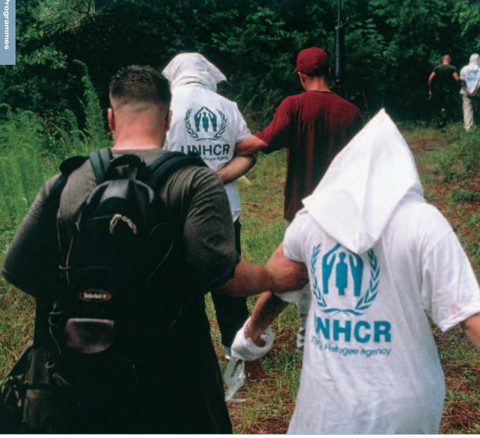
USA: Workshop on Emergency Management (WEM) / Training in Marine Corps Base Camp Lejeune in North Carolina.

to enhance UNHCR's performance in this sphere. Ongoing large-scale operations, as well as new emergency situations, drew significantly on internal and external emergency stand-by resources. In 2002, UNHCR and stand-by partners deployed 118 persons to 21 countries on an emergency basis (Afghanistan, Angola, Cambodia, Cameroon, the Democratic Republic of the Congo, Côte d'Ivoire, Ethiopia, Eritrea, Guinea, Indonesia, the Islamic Republic of Iran, Jordan, Kenya, Liberia, Malaysia, Nepal,