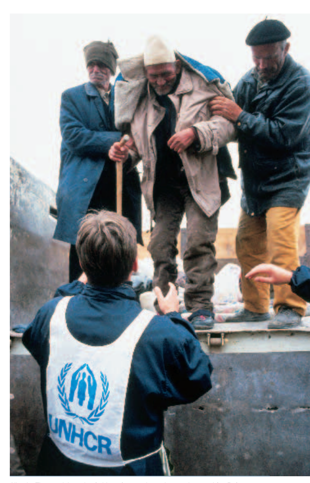
Albania: The special needs of older refugees always have to be cared for. Refugees from Kosovo.

Two major projects planned for 2002 were postponed due to the budgetary difficulties faced by UNHCR in the latter part of the year. Training mate-