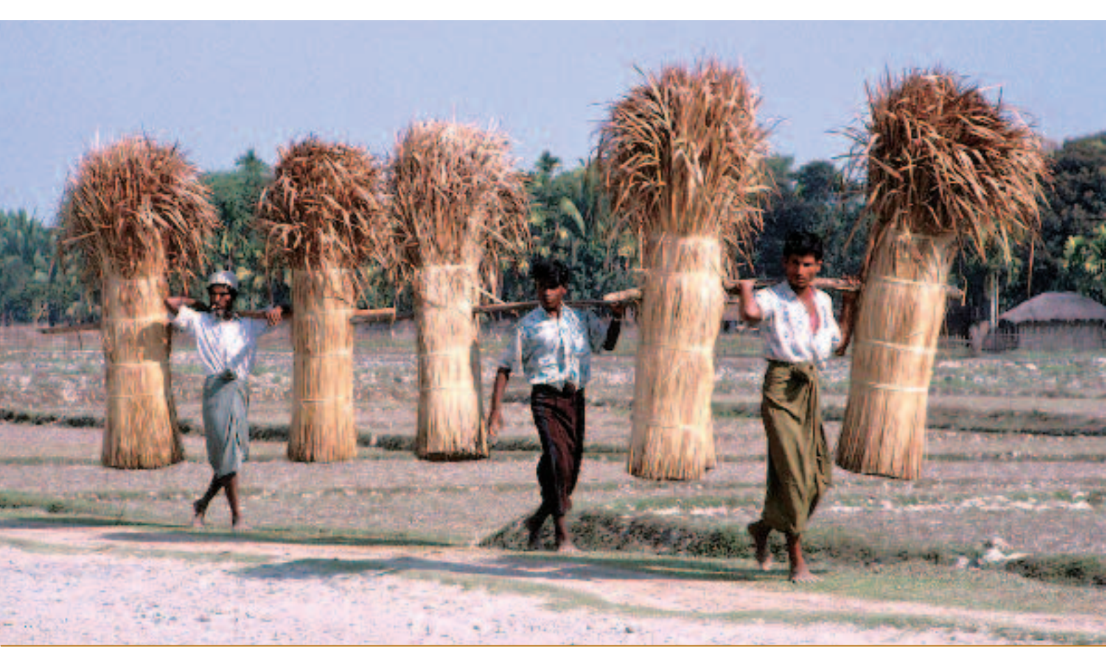
Myanmar: Returnees participating in school reconstruction.

for the refugees. UNHCR's assistance activities continued to focus on meeting the needs of vulnerable groups such as women, children and the elderly. To reduce the dependence of refugees on subsistence allowances and help them prepare for eventual durable solutions, UNHCR developed its strategy for a gradual phase-out over a 15-month period. This approach was developed in collaboration with partners and shared with all stakeholders. Alongside this process, active support towards self-sufficiency was initiated in the course of 2002 through the launch of a multi-year self-reliance scheme involving the provision of vocational training. A total of 557 refugees benefited from the scheme.