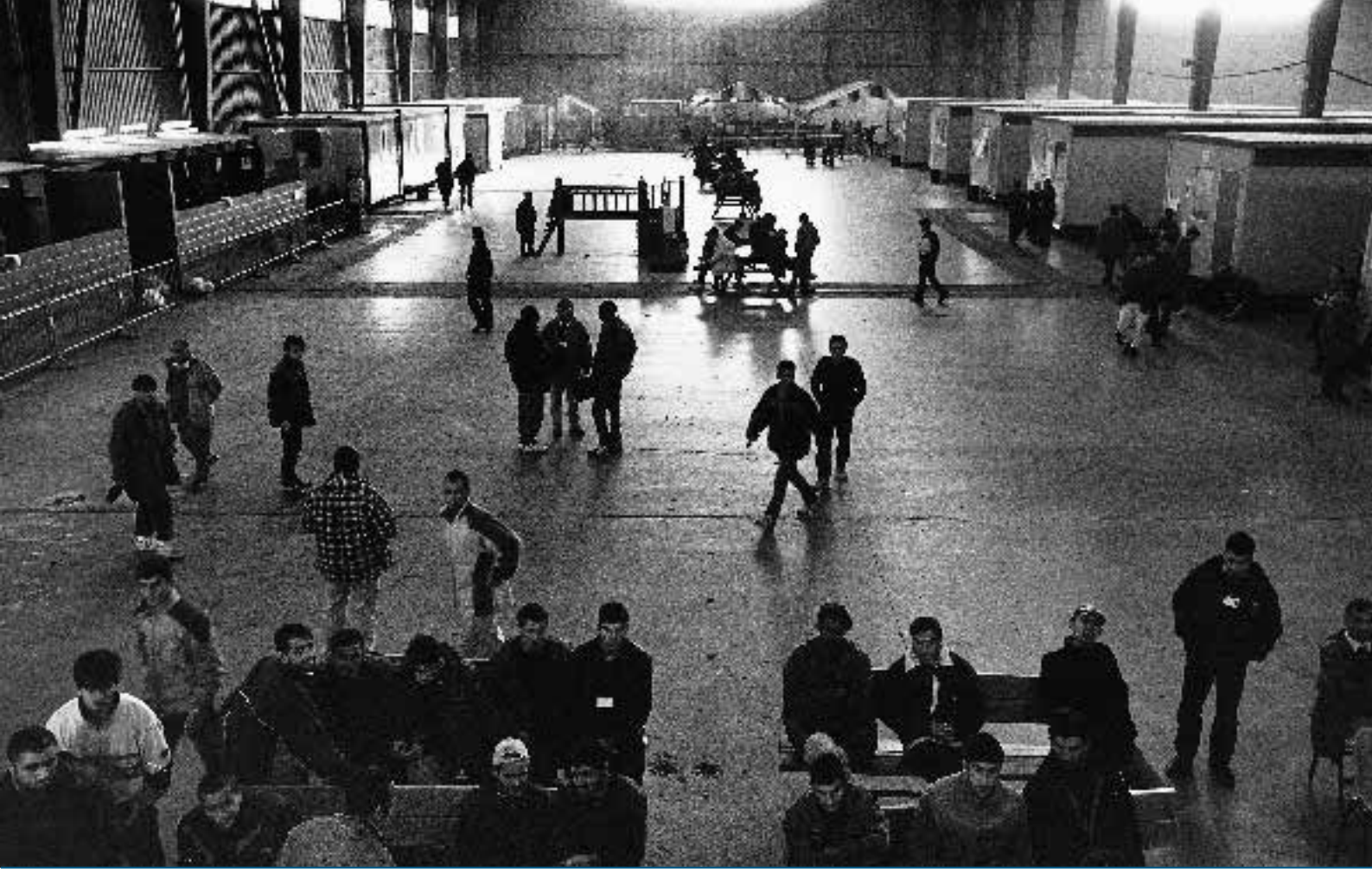
France: The Sangatte reception centre for asylum-seekers in northern France was closed at the end of December 2002. Most of its residents were transferred to the UK, in accordance with a burden-sharing agreement reached between the two Governments. Others were relocated elsewhere in France, while a small number of Afghans opted to go back home with a special voluntary repatriation package offered by the French Government.