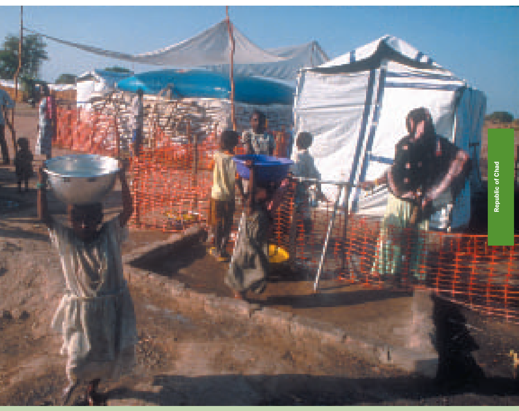
During 2003, some 33,000 refugees from the Central African Republic found shelter in towns in southern Chad. Here, refugees have free access to fresh water.

adequately. The Office assisted the voluntary repatriation of 88 Congolese to DRC and one family to Rwanda. No resettlement took place during the year.