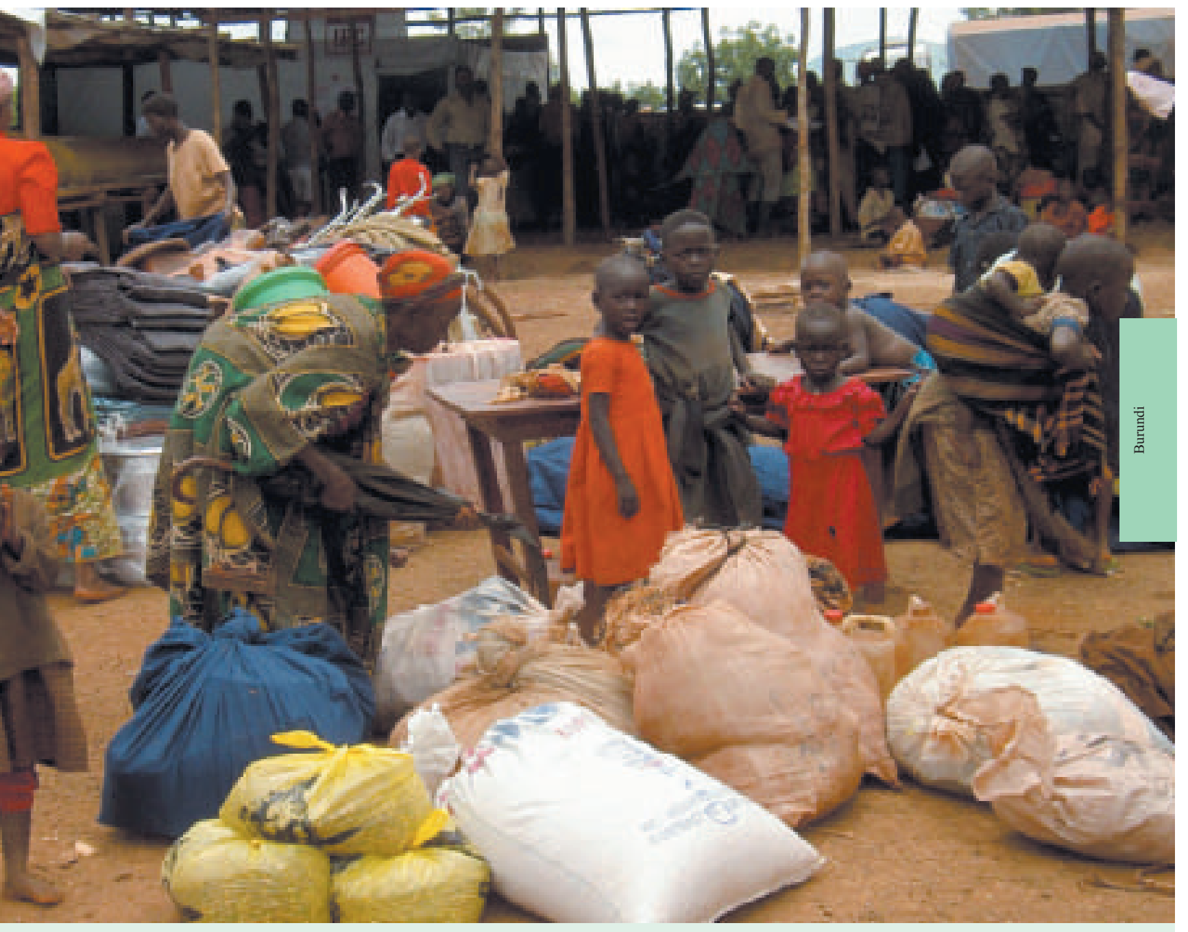
Burundian returnees who just arrived from Tanzania at Gisuru reception centre - sorting their belongings as they prepare for a new life at home.

safety and dignity and be repatriated home if conditions allow. The adoption of asylum legislation should significantly speed up the process of recognizing refugees on Burundian soil and ensure their access to all basic services.