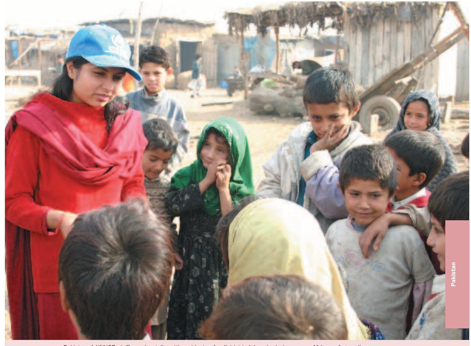
Pakistan: A UNHCR staff member talks with residents of a district in Islamabad where many Afghan refugees live.

Operational support (to agencies): Financial support was provided to NGOs as well as governmental partners implementing UNHCR assistance projects. Rationalization measures helped to reduce operational support costs and to standardize salaries among partners.