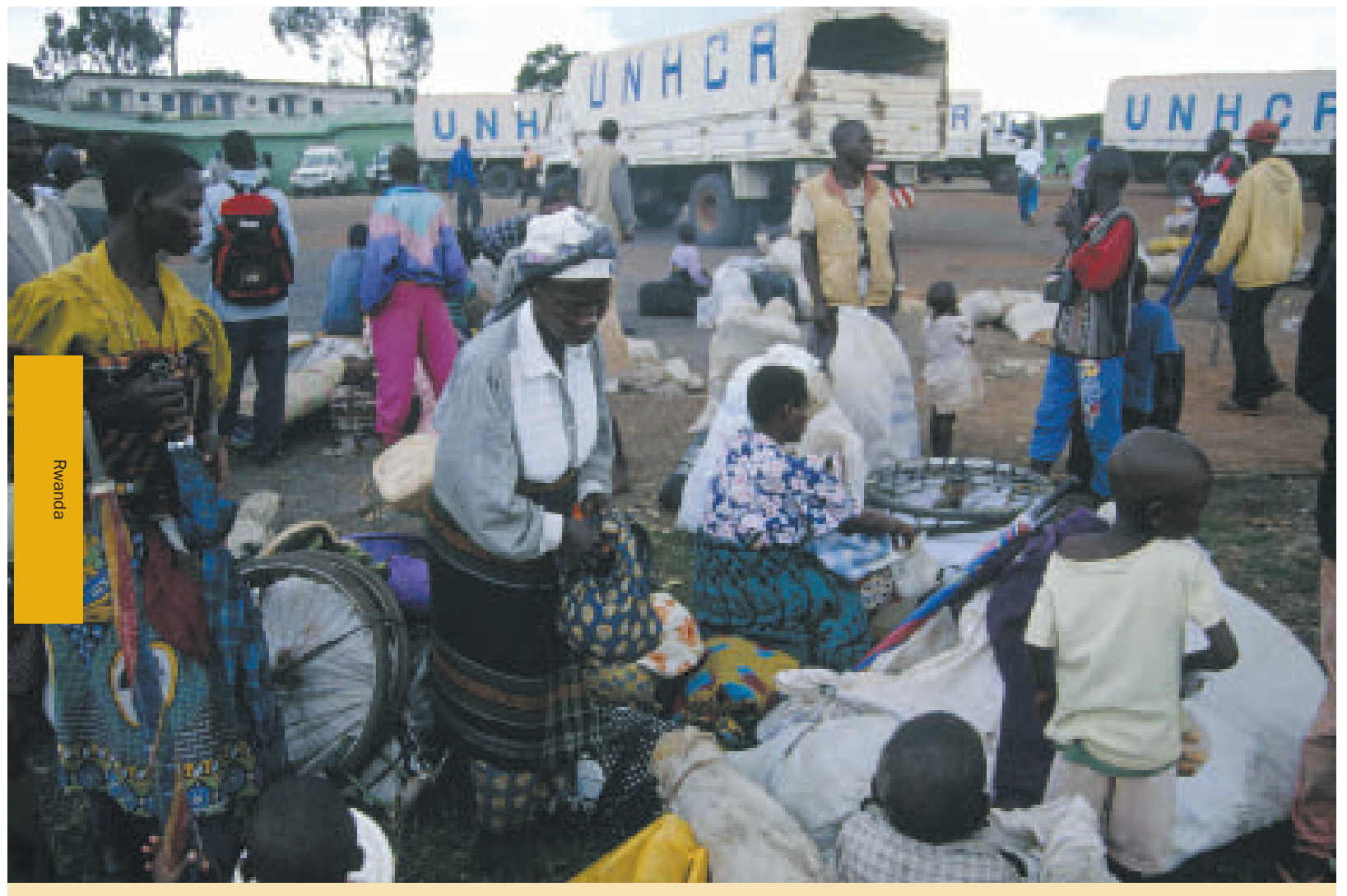
Arrival of a returnee convoy from the DRC at the transit centre in Byumba, northern Rwanda.