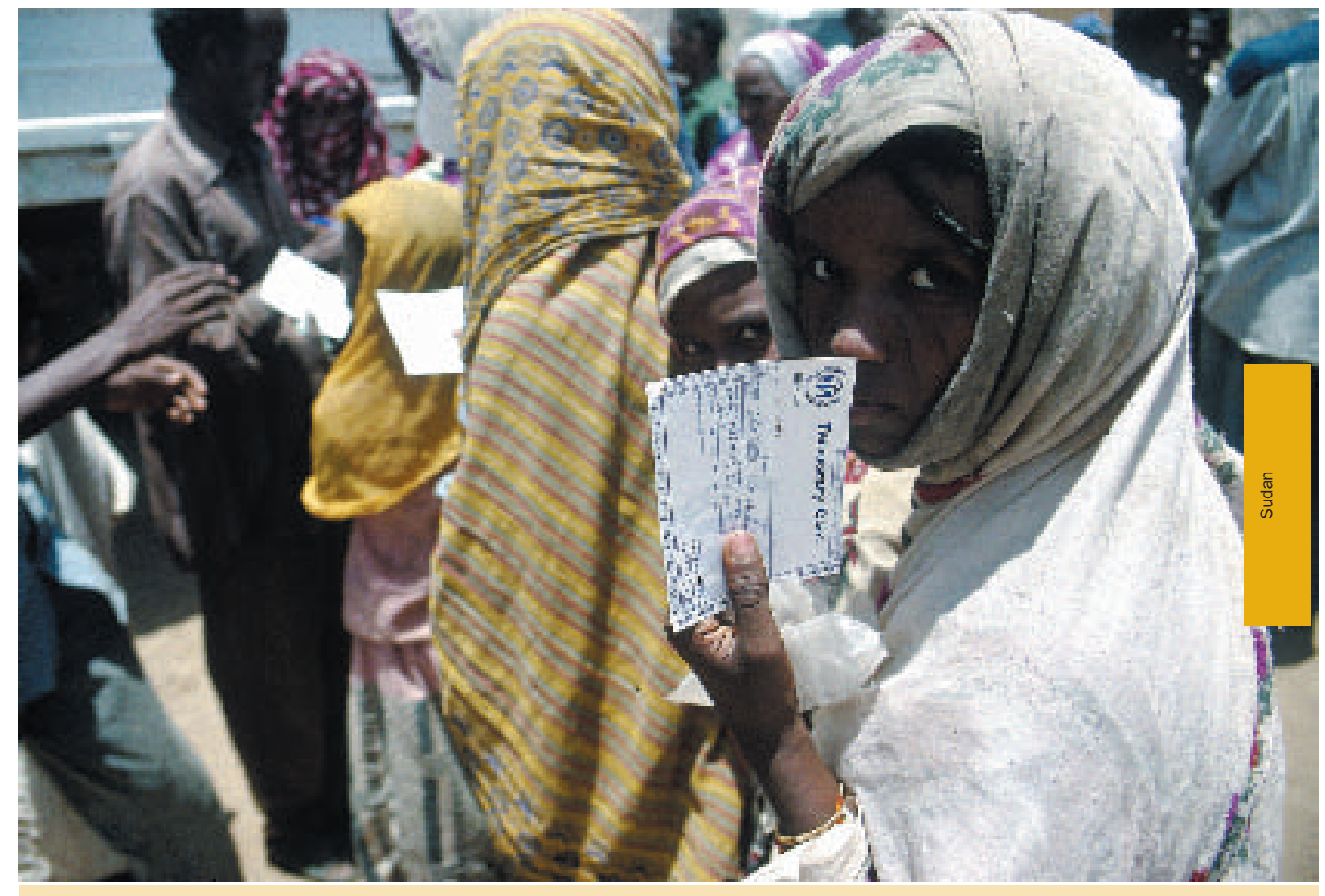
An Eritrean refugee in eastern Sudan is queuing to receive her monthly food ration, with her UNHCR card in hand.