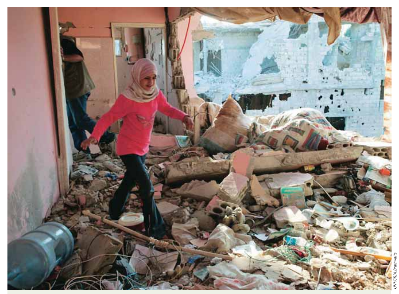
A returnee girl shortly after arriving at her apartment in the lebanese village of Ayta-e Shaab.

linking the main cities in the Syrian Arab Republic with the main cities of return in Lebanon to aid those refugees who did not have the means to return on their own.