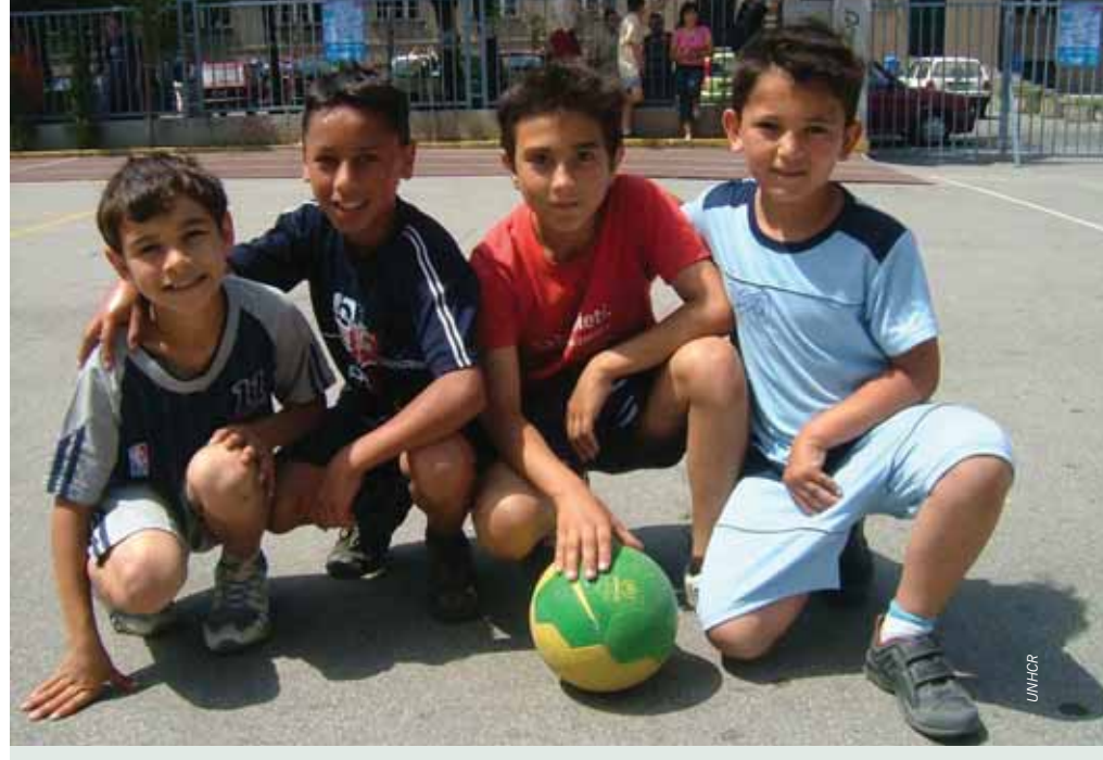
Players at a UNHCR-run soccer tournament in Belgrade organised on World Refugee Day, with one of the balls donated by Nike for the launch of the nine million.org campaign.

Although a reception centre for asylum-seekers was completed in 2006, the centre did not become operational because the asylum law had not been adopted and staff could not be appointed. Furthermore, television programmes informing refugees and IDPs on the situation in return areas were broadcast, with an average weekly viewer rate of 500,000 persons. These programmes allowed people to make an informed decision on whether to return or not.