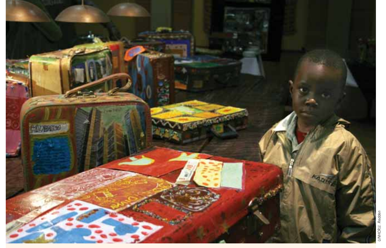
An art therapy project for refugee children produced the painted suitcases shown here. The project also resulted in a book, The Suitcase Stories - Refugee Children Reclaim their Identities, where children tell of their lives in words and pictures.