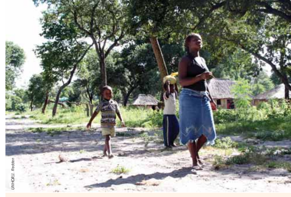
Angolan refugees in Nangweshi camp at the beginning of 2006. By the end of the year the camp had been closed and those refugees who did not wish to repatriate were relocated to Mayukwayukwa settlement, where they had access to land and services.

UNHCR's objectives in Zambia were to assist the voluntary repatriation of Angolan refugees; work with the Government to facilitate the local integration of those Angolan refugees who do not opt for voluntary repatriation; promote development programmes in refugee-hosting areas for both refugees and local communities; explore durable solutions, such as local integration and voluntary repatriation, for Rwandan refugees, and resettlement for the most vulnerable refugees; and pursue voluntary repatriation to safe areas of Burundi and the DRC.