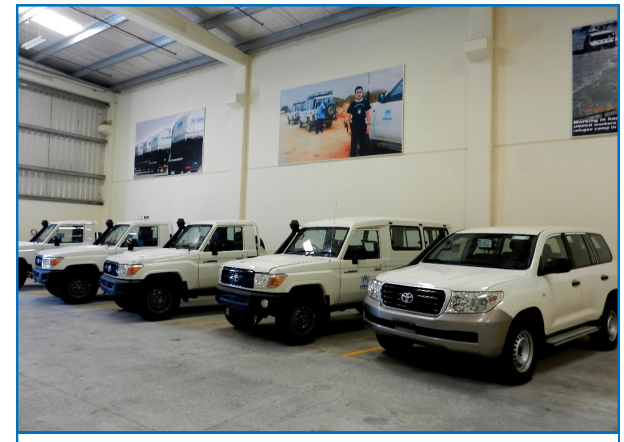
Vehicles are stocked in the warehouses and shipped to areas of need when necessary.

The current 5 member team in Dubai also manages a stock of vehicles, mainly four wheel drives. The stock holds up to 100 units and shortens the delivery time for operations from several months to a maximum of few weeks. Many of the vehicles are equipped with specific safety and radio equipment in order to protect staff and ensure adequate communication. Installations are done to order within 48 hours.