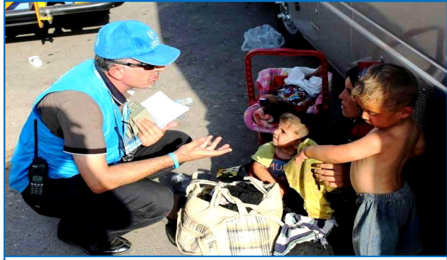
A UNHCR field officer interacts with a family from Syria in Iraqi Kurdistan.