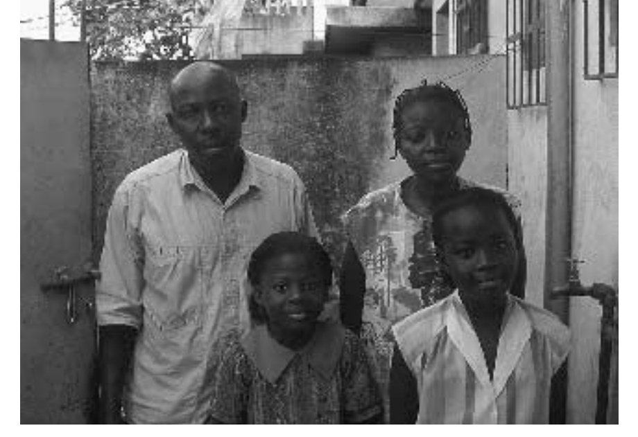
UNHCR provides material assistance to some urban refugees: urban refugees from Burundi.

Shelter/Other Infrastructure: At Nicla camp, 123 huts were renovated and 30 new shelters were built