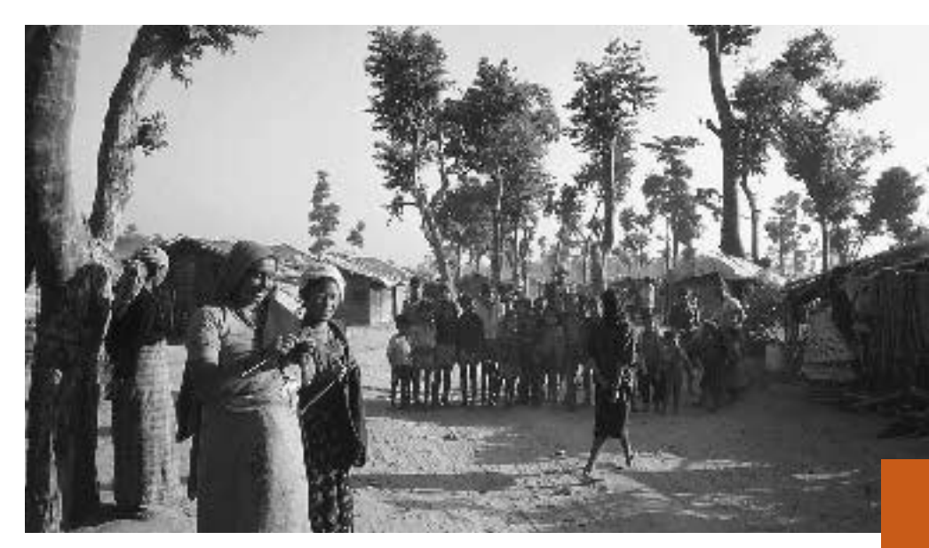
Nepal: Refugee women have increasingly become involved in self-help activities. Bhutanese refugees in Jhapa District.

In India, UNHCR continued to provide protection and assistance to some 13,000 urban refugees, the majority being Afghans. UNHCR worked hard to persuade the Government to resolve the longstanding issue of the renewal of residence permits for refugees in order to regularise their status. With no immediate prospect of voluntary repatriation, a total of 1,531 eligible refugees were resettled to third countries in 2001. For those refugees who