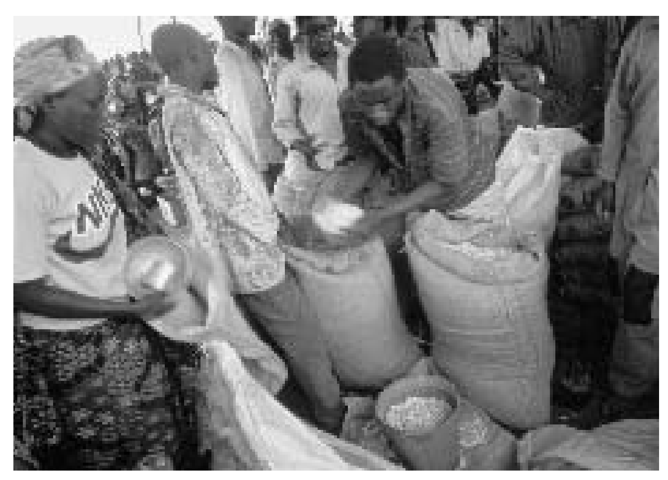
Tanzania: Food distribution to refugees from Rwanda and Burundi in Kibondo.

material resources needed for effective implementation of its programmes in the region. The Office hopes to achieve these objectives by building consensus within the international community and among host/asylum countries to ensure that the protection of refugees and solutions to refugees problems are a shared responsibility.