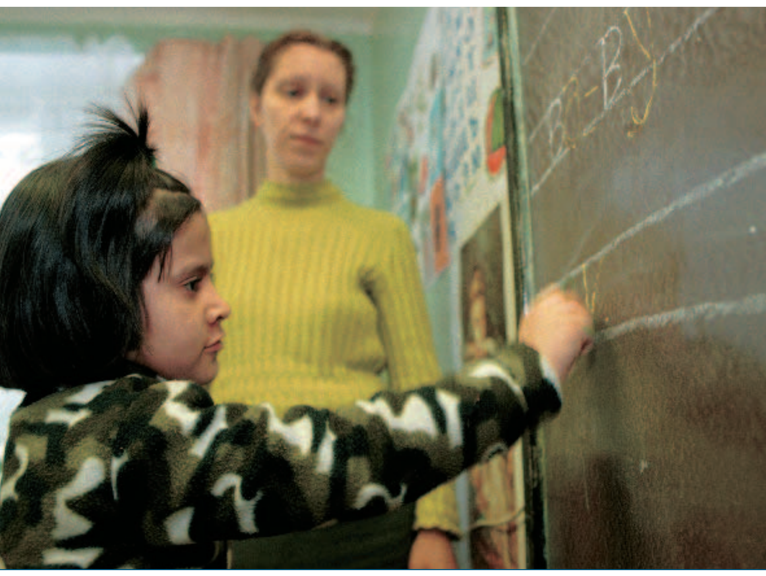
Russian Federation: A young asylum-seeker attending public school near an accommodation centre in the Moscow region. UNHCR

system, integrating it into the international refugee protection system and reducing statelessness. The newly adopted national refugee law was entirely in line with the 1951 Refugee Convention, and a new citizenship law addressed UNHCR's concerns. The opening of a temporary accommodation centre in Vitebsk helped ease the difficulties of vulnerable asylum-seekers, but the integration of recognised refugees remained problematic.