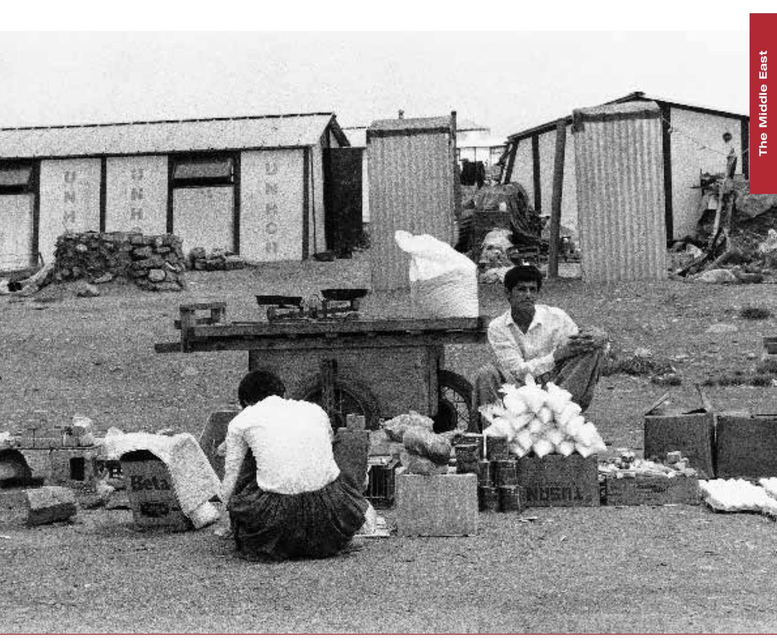
Iraq: Prefabs given by UNHCR to displaced persons and returnees who cannot go back home.

In Lebanon , UNHCR provided protection and assistance to 2,450 refugees of mainly Iraqi, Sudanese and Somali origin. In the absence of