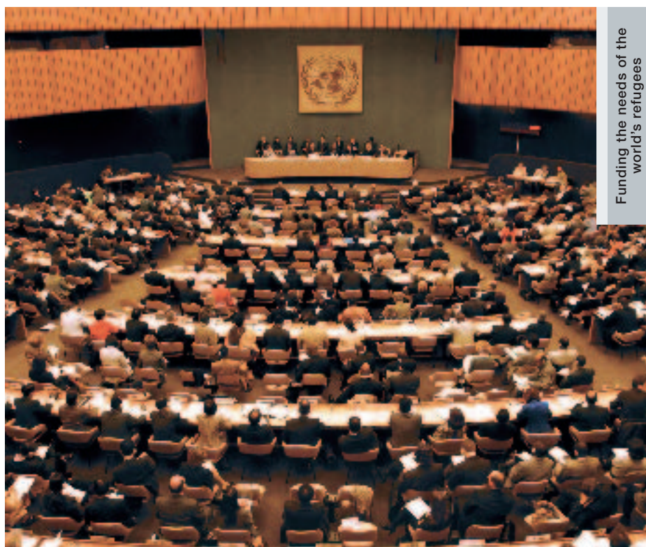
Every October, UNHCR's governing body, the Executive Committee of the High Commissioner's Programme (ExCom) meets in a plenary session in Geneva – October 2002.

In order to enhance the sense of participation by private donors, fund raising for this sector will, in 2004, be directed towards clearly identified activities within the UNHCR Annual Budget. Focusing attention in this manner will give private donors a clearer understanding of what is being achieved as a result of their support. It is anticipated that this strategy, endorsed by the High Commissioner, will maintain the interest of individual donors, and ensure their sustained support over a period of several years.