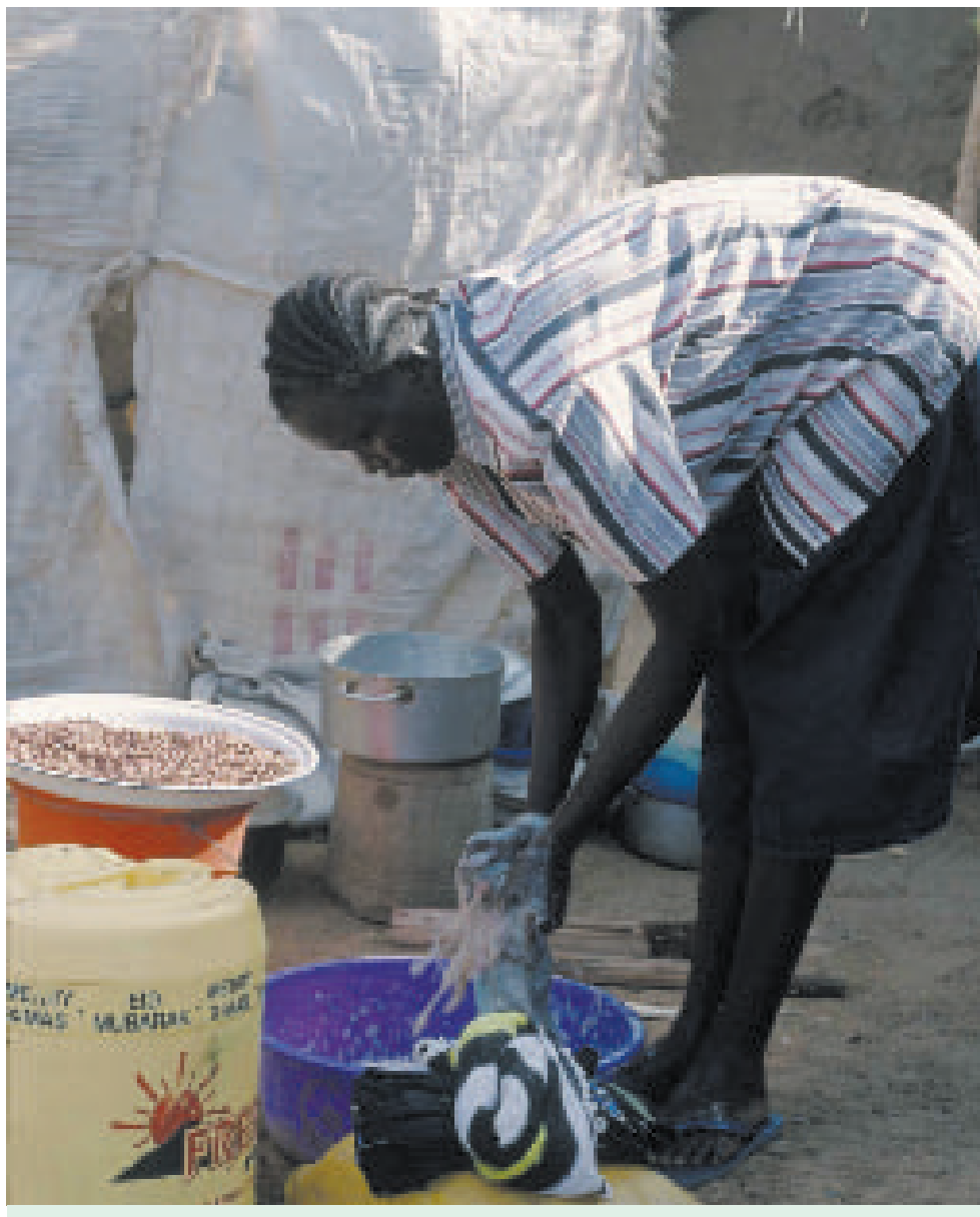
Among the Sudanese refugees, there are many unaccompanied minors like this one, "The Lost Girls of Sudan" in Kakuma camp.

With respect to refugees from the Great Lakes Region, negotiations on a Tripartite Agreement on voluntary repatriation of Rwandan refugees are under way, to be finalized, it is hoped, within the last quarter of 2004.