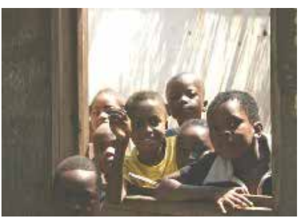
Children in Equateur, looking forward to attend school in rehabilitated classrooms

UNHCR continues to work closely with the UN Humanitarian Coordinator and the OCHA facilitated Consolidated Appeals Process including, in particular, plans and programmes relating to the voluntary return and reintegration of Congolese refugees. Within the existing UN Country Team framework, UNHCR coordinates its humanitarian interventions with its partners, particularly OCHA, UNICEF, WHO, WFP, FAO, UNAIDS, UNDP, World Bank and MONUC. Memoranda of Understanding with some of these agencies will be signed for a complementary approach to assist the repatriation and reintegration.