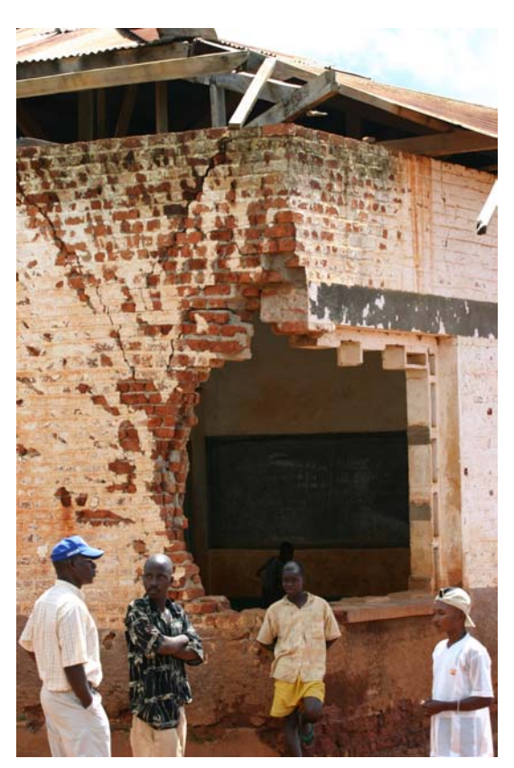
Lessons have restarted in the shell-pierced school building of Fizi in South Kivu

Since the mid-1990s, millions of Congolese have fled their homes to escape fighting between rebel groups and the national authorities in a complex conflict which has involved almost all neighbouring countries. More than three million people have died as a result of the conflict, which was accompanied by widespread human rights violations including systematic killings and rape. Massive population displacement took place. An estimated 2.3 million Congolese are internally displaced, while another 381,000 Congolese are in exile as refugees, mainly in neighbouring countries.