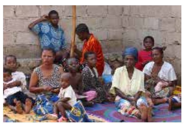
Spontaneous returnees in an Uvria transit centre, South Kivu

In addition to returnees the beneficiary population comprises the recipient local communities in the DRC in line with the community-based approach. Although UNHCR is not directly engaged in assistance to IDPs in the DRC, the Office will ensure that those IDPs returning to the same areas as refugees will be included in the community-based approach, so as to promote peaceful coexistence.