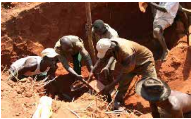
Preparing bricks for rehabilitation of community infrastructure, Equateur

supported, additional waystations will be constructed and roads will be rehabilitated. This approach will continuously be revised, in order to allow the operation to react in a flexible way to improvement or deterioration of the situation in areas of return. The assistance programme might also be extended to other provinces if appropriate, including northern Katanga.