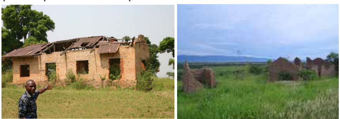
Equateur (left) and eastern DRC (right): Refugees often find their houses and village infrastructure completely destroyed upon return

This initial repatriation and reintegration programme is part of a phased multi-year framework for return to the DRC which is under development. UNHCR initially appeals for US$ 15.6 million for the first phase of the programme in 2005. Once the benchmarks for facilitated refugee return in other areas of origin in the DRC are met, the operation may involve return from up to nine neighbouring countries.