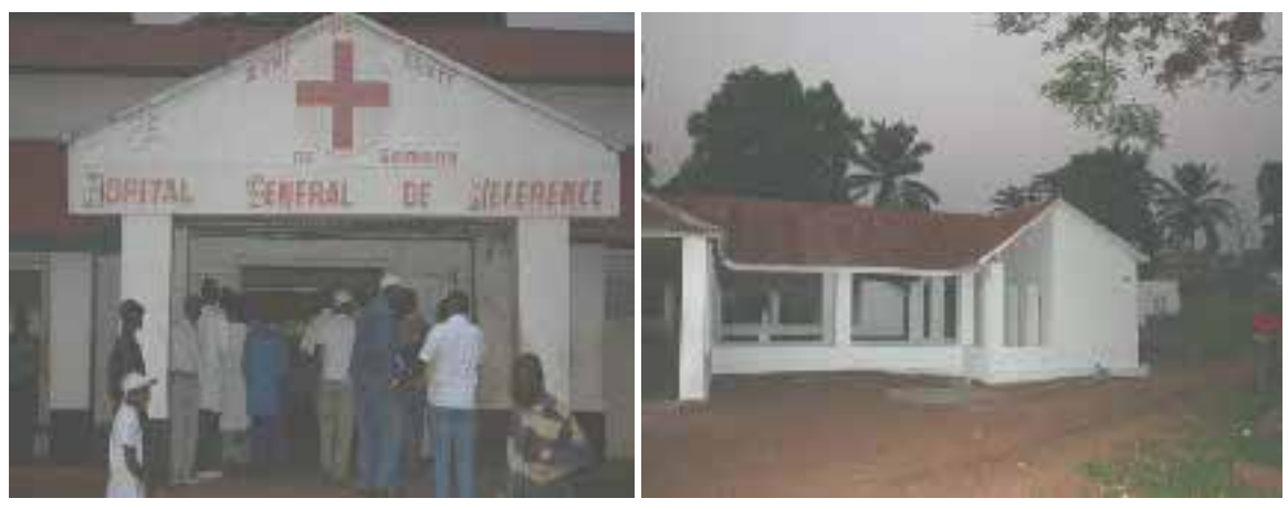
Health centre in Gemena, Equateur, rehabilitated and equipped with an extension.