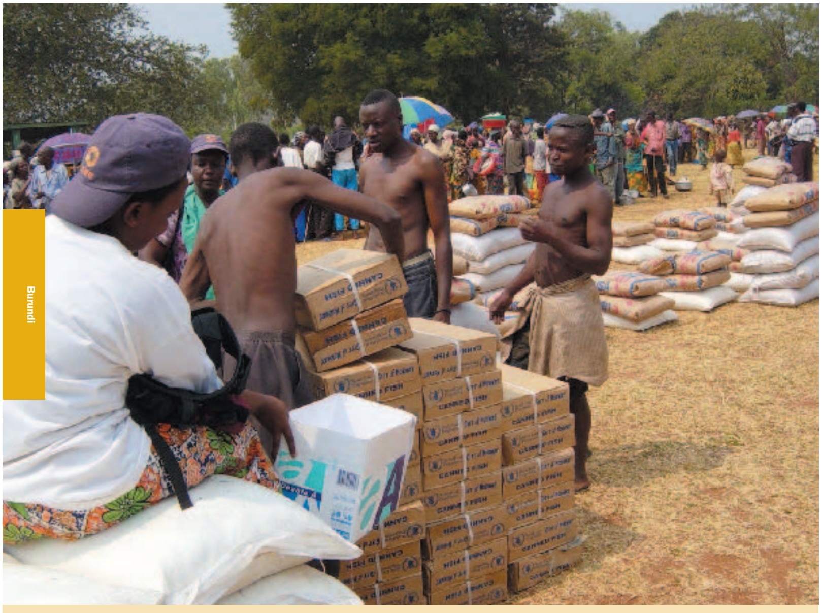
Burundi: Congolese refugees at Cibitoke, Rugumbo Province benefited from the distribution of food.

Food: WFP provided sufficient food in the camps. In total (for refugees and returnees) more than 4,700 tons of food were distributed.