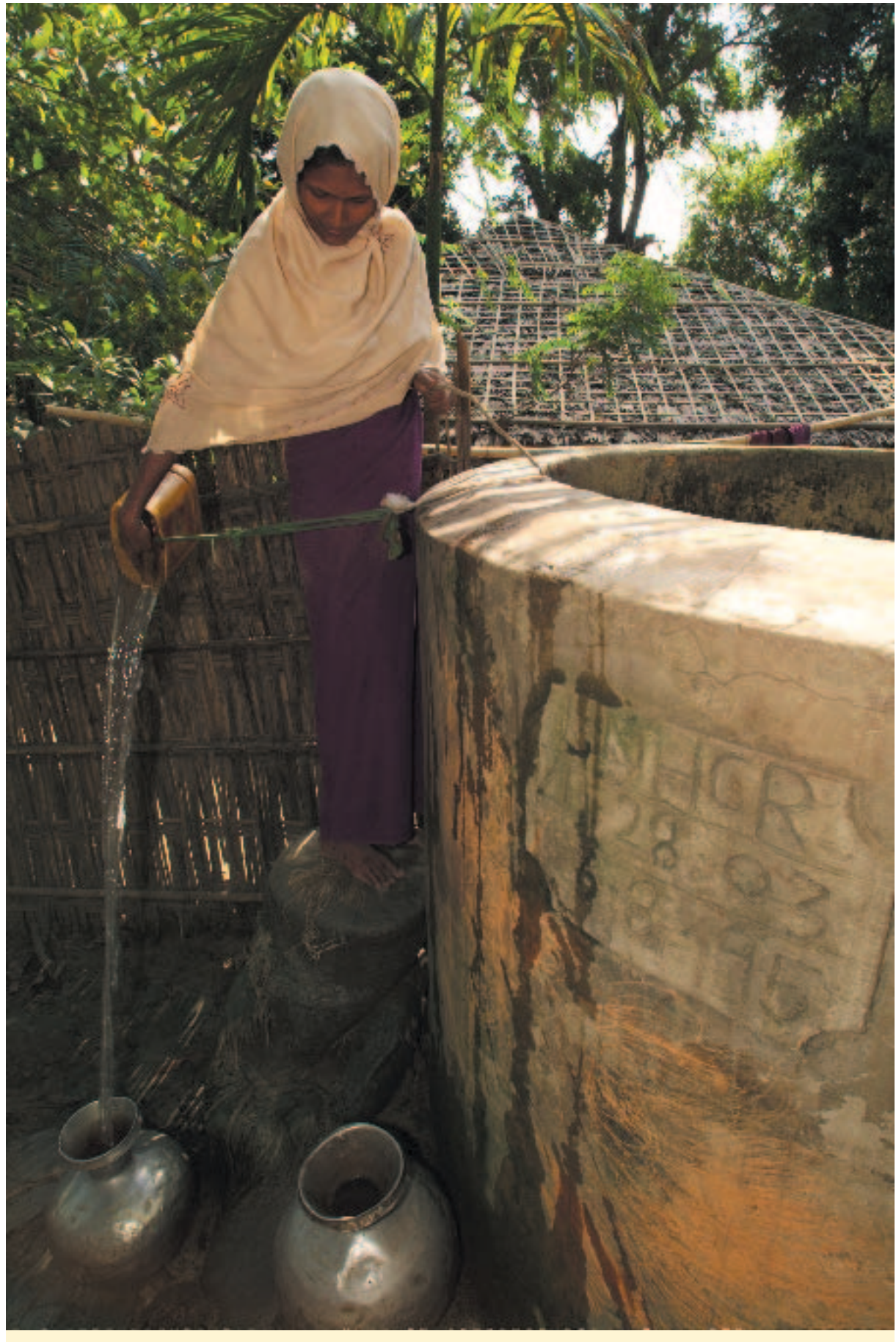
Myanmar: Clean drinking water is provided by UNHCR for returnees.

tangible and significant impact in reducing or mitigating the problems faced by returnees, especially the more vulnerable among them.