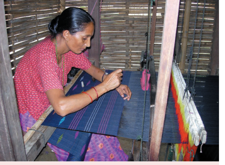
A Bhutanese refugee weaves traditional shawls at Timai camp in Nepal.

In 2005, the role of women in camp management was augmented, with almost 50 per cent female representation on the camp management committee. The appointment of women to the Community Watch Teams strengthened the protection of women and children, in particular with respect to SGBV. The teams had to increase their responsibilities to compensate for the absence of police.