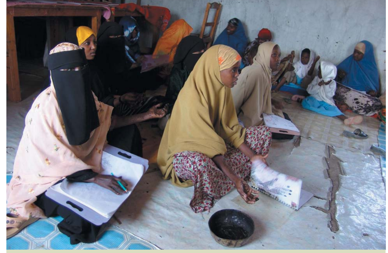
Yemen: Henna skills training for Somali refugees in Kharaz camp.

Political, economic and security conditions in countries bordering Jordan – Iraq to the east, Israel and the West Bank to the west – continue to have a direct bearing on Jordan. A large proportion – estimated at 65 per cent – of Jordan's population is of Palestinian origin. More than 500,000 Iraqis are also living in the country, many of whom left Iraq after the war in 2003. This group benefited from the Temporary Protection Regime until the Government declared it to be no longer applicable to Iraqis in 2005. However, UNHCR is counting on the Government of Jordan to show flexibility and tolerance for persons of concern to the Office.