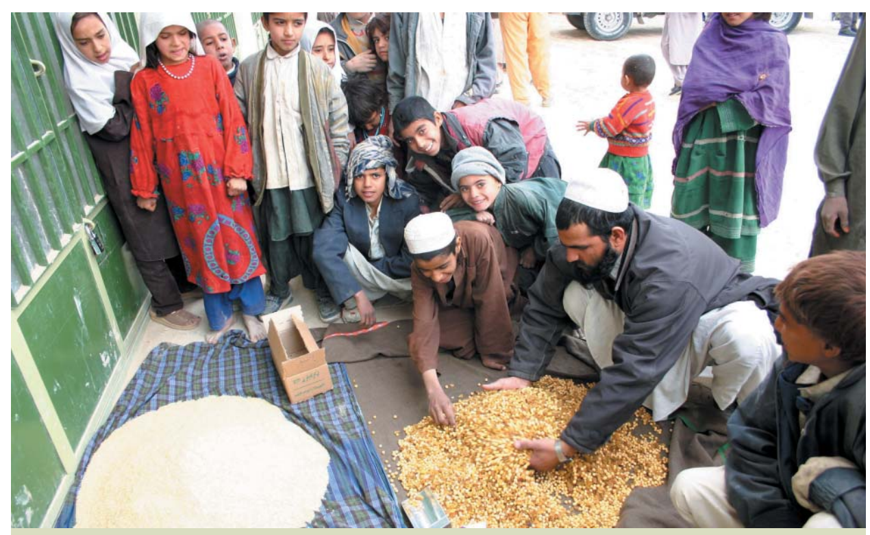
Afghan refugees try to make a living by selling food at a market in Sistan-Balochistan, Iran's poorest province.

The Ministry of the Interior, through the Bureau for Aliens and Foreign Immigrant Affairs is UNHCR's main counterpart and implementing partner. All discussions with other line ministries and national NGOs, including implementing partners, are coordinated through BAFIA, which serves as the Secretariat for the National Council for Foreigners Policy. A very limited number of national NGOs work as implementing partners for UNHCR.