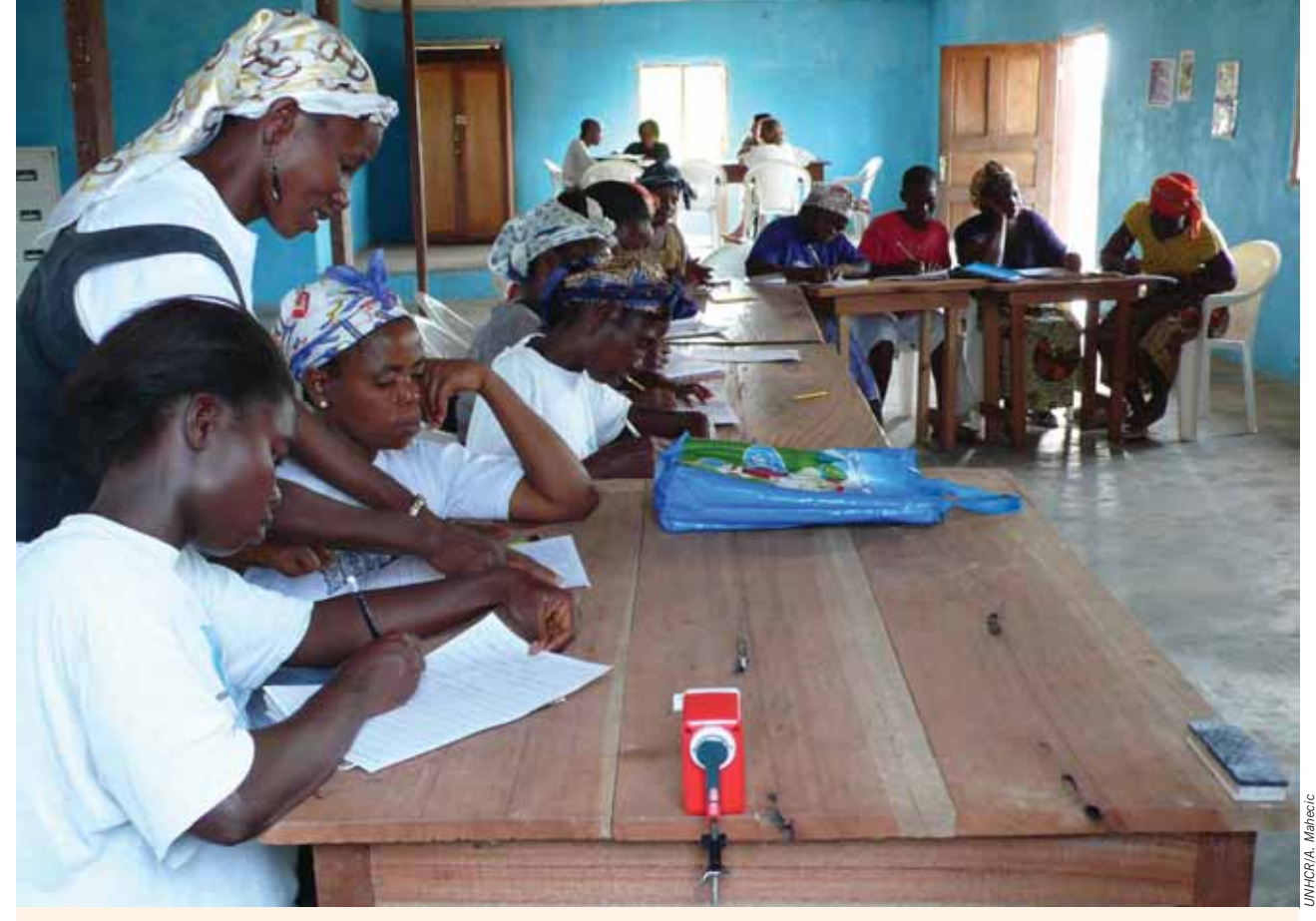
UNHCR-funded Suakoko Women's Centre in Gong County.

Health and nutrition: UNHCR supported 49 primary health-care facilities which also contributed to the prevention of HIV and AIDS. One million condoms and HIV and AIDS awareness materials were distributed countrywide. In refugee-hosting areas in the east of the country, UNHCR supported ambulance services and helped to reduce maternal mortality rates.