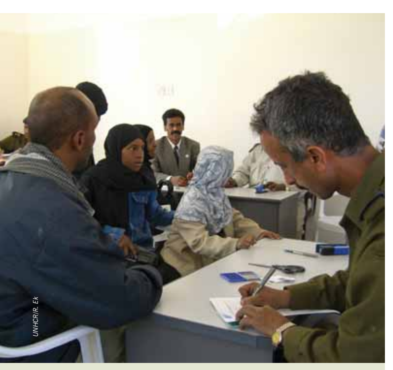
Registration of Somali refugees in Sana'a.

for some of them. UNHCR is endeavouring to improve their living conditions in Yemen.