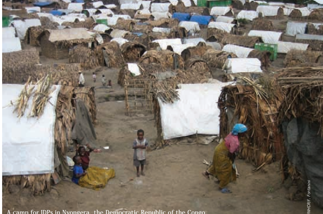
A camp for IDPs in Nyongera, the Democratic Republic of the Congo.

As the work of the clusters is being consolidated in 2009, many of the activities will be fully mainstreamed, although some recurrent costs may remain through the transition period in 2009.