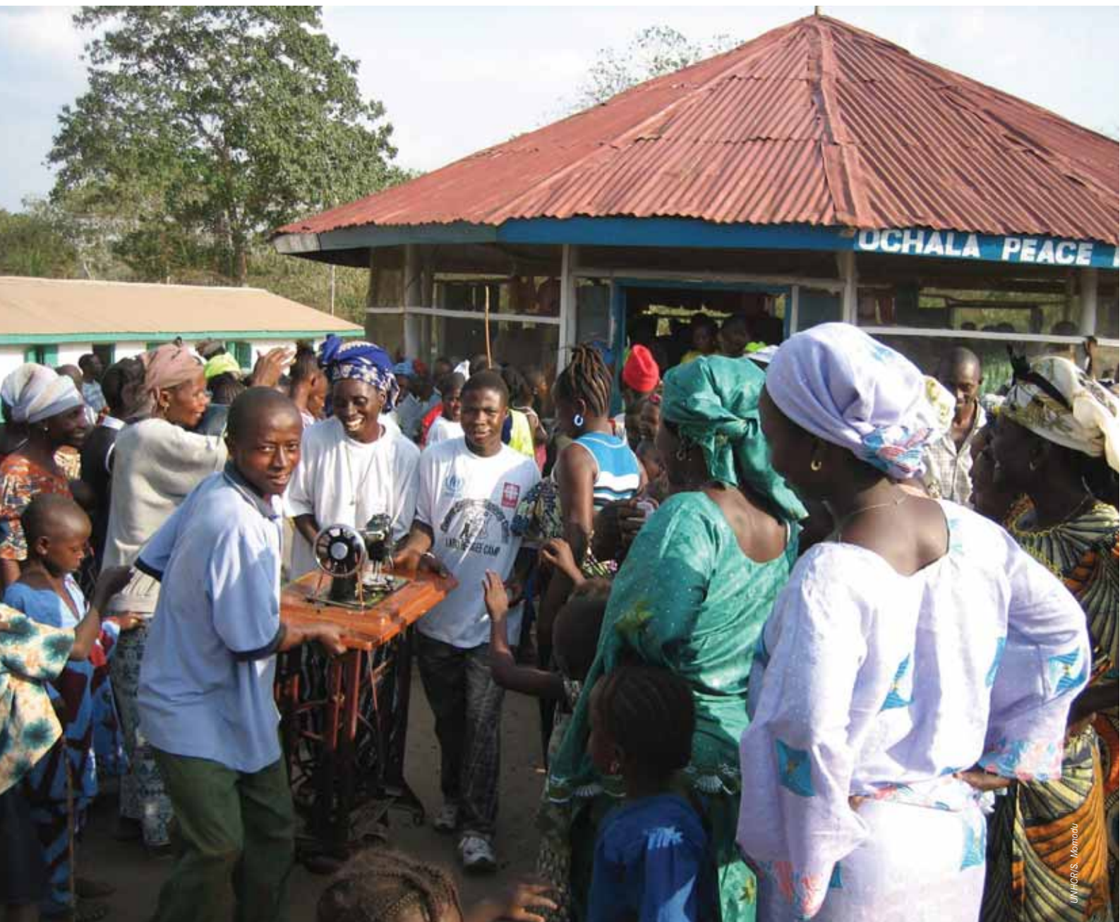
Graduation ceremony at the Angelina Jolie Skills Training Project. The 50 graduating refugee women received a certificate and one sewing machine each.