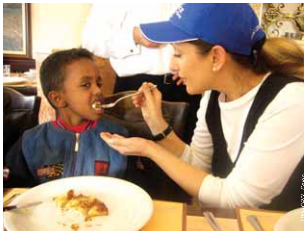
UNHCR Goodwill Ambassador Muazzez Ersoy feeds a young boy at a lunch she hosted for refugee families in the Turkish capital, Ankara.

The prevailing instability of countries neighbouring Turkey may affect the access of people in need of international protection to fair and efficient asylum procedures.