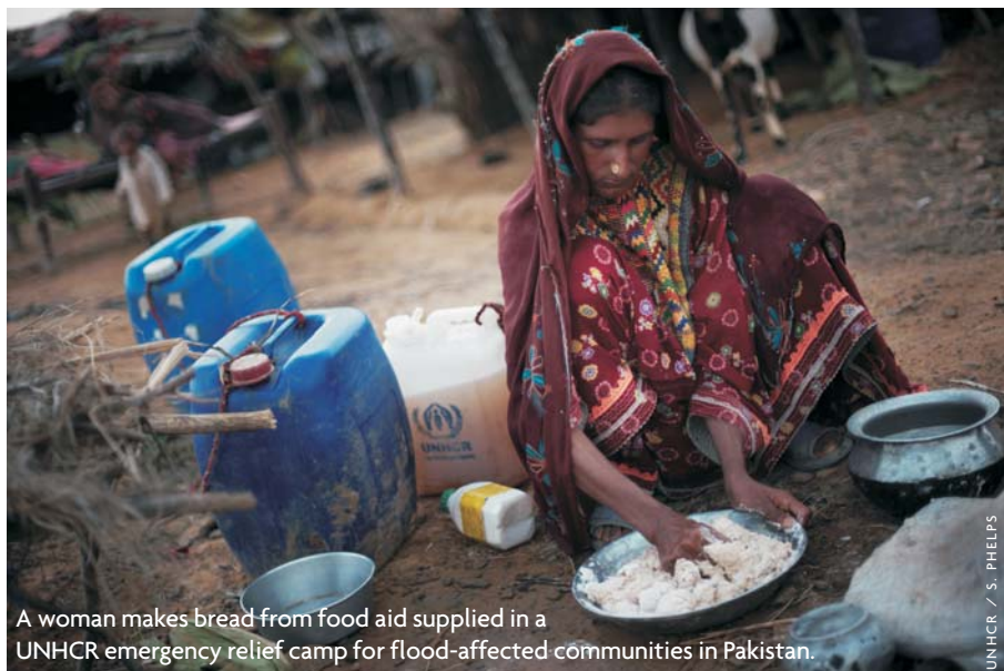
A woman makes bread from food aid supplied in a UNHCR emergency relief camp for flood-affected communities in Pakistan.