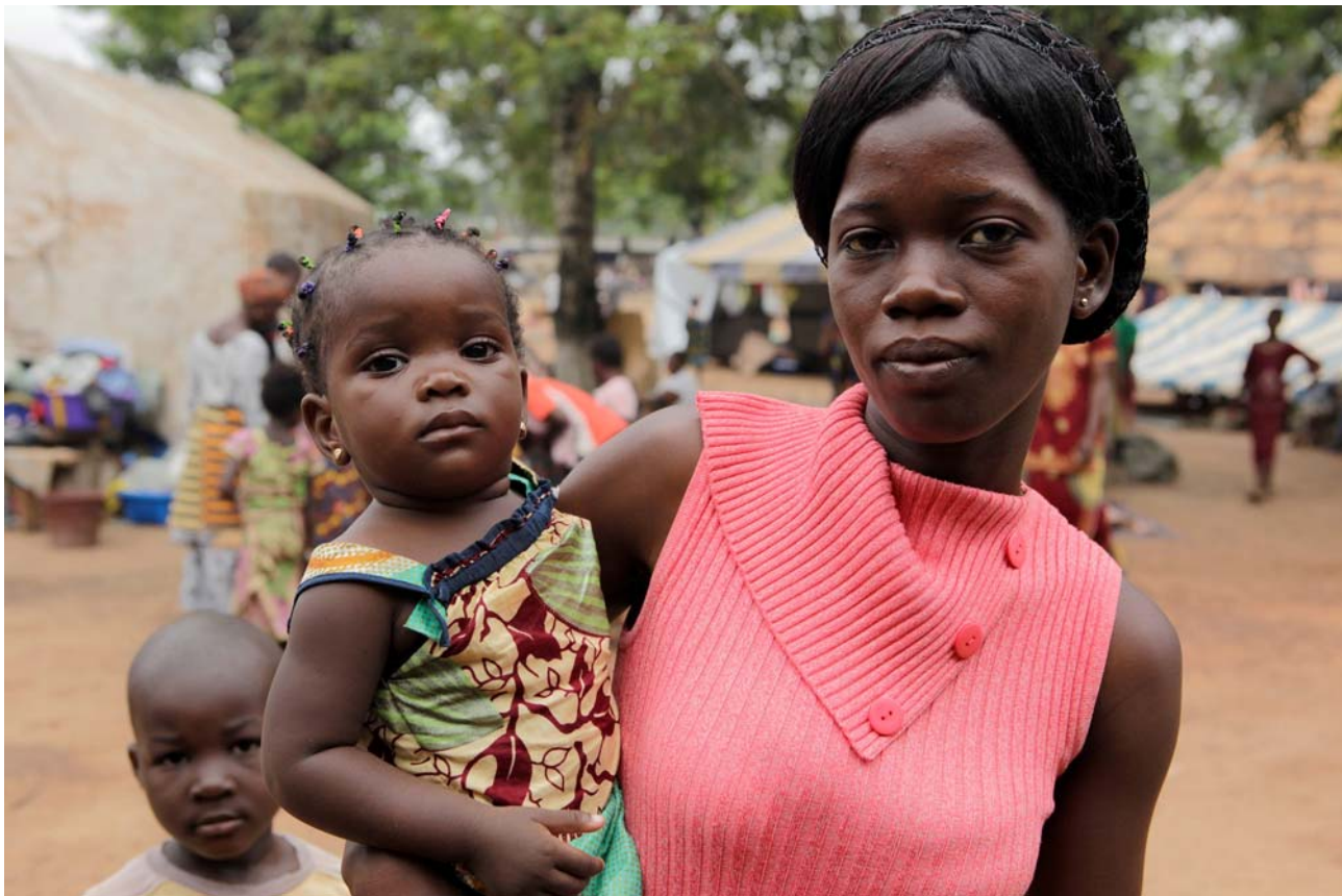
UNHCR / H. CAUX—CÔTE D'IVOIRE / FEBRUARY 2011

(*) Additionally, in December 2010 Luxembourg donated USD 87,015 to UNHCR's initial response to the emergency in Côte d'Ivoire