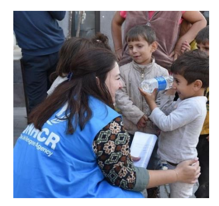
Recently arrived refugee children wait at the registration centre in Goris, Syunik province on 29 September.

two registration centres established in the border provinces. Most refugees arrived with few belongings and require urgent assistance, including blankets, bedding materials, medical and psychosocial support, as well as shelter in the immediate term. Armenian authorities are providing temporary accommodation to 34,607 new arrivals without relatives in Armenia, including in hotels, social centres and schools. However, given the high number of arrivals in the short period, additional emergency centres are urgently needed. The Government together with the international and national community are working to address urgent needs of those arriving.