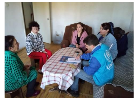
UNHCR carries out protection monitoring with a group of refugee women living in a temporary shelter in the Aragatsotn province.

UNHCR is grateful for the support of donors: Australia | Belgium | Canada | CERF | Denmark | France | Germany | Ireland | Japan | Netherlands | Norway | Poland | Sweden | Switzerland | United Kingdom | United States of America