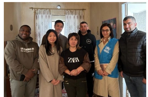
Vayots Dzor province – Delegates from the Embassy of Japan in Armenia and UNHCR met with a refugee family in Areni community to learn about their well-being and urgent needs.

UNHCR facilitated a field visit for delegates from the Embassy of Japan to Vayots Dzor region, southeast Armenia to observe the situation of refugees and host communities, as well as the overall humanitarian response. During the visit, the delegates had the opportunity to meet with refugees benefitting from non-food items (NFIs), including folding beds and mattresses, through a generous contribution from the People of Japan. Refugee beneficiaries expressed their appreciation for the timely assistance which is helping them prepare for the winter season.