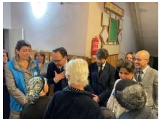
Masis, Ararat province – Delegates from France and UNHCR Representative spoke with refugees in a shelter home about their urgent needs.

On 12 December 2023, UNHCR facilitated a field visit for the French Delegation, which meet with refugees and spoke about their urgent lifesaving needs. The Delegation, including the French Ambassador to Armenia, and a French Parliamentarian, who is also a Member of the Parliamentary Assembly of the Council of Europe, visited a temporary shelter home in Masis town, Ararat region, hosting 67 refugees from Karabakh. Refugees, among them women, children, older people and persons with disabilities were grateful for the French Government's support provided through UNHCR, including the provision of core relief items, that helped them prepare for the winter season.