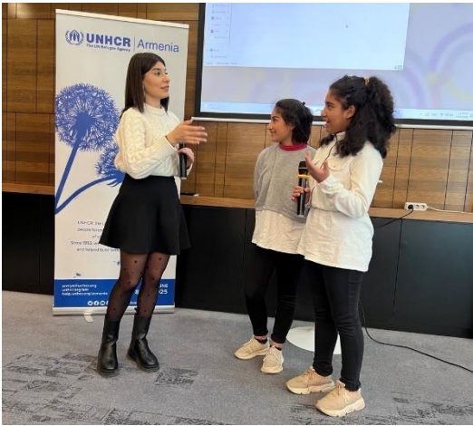
Syrian refugee siblings reflecting on their experience as part of the "Youth Integration and Participation" project. December 2023. Yerevan

80 refugees and host community older persons participated in a community event (23 December) organised in Goris, Syunik region. The initiative aimed to strengthen social cohesion and was part of UNHCR's targeted outreach to older refugees in Lori, Tavush, Shirak, and Syunik regions.