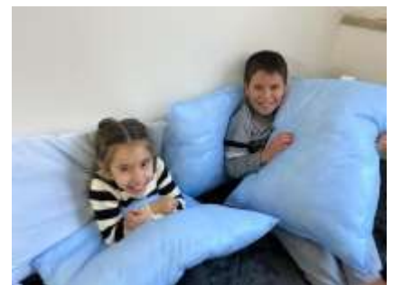
Armavir province. UNHCR continues distributing core relief items, such as pillows and blankets to the most vulnerable refugees from Karabakh, among them many children. December 2023.

Throughout December, UNHCR, UNICEF, and IOM combined efforts to provide 10 training sessions for 130 people from over 70 organizations to strengthen reporting