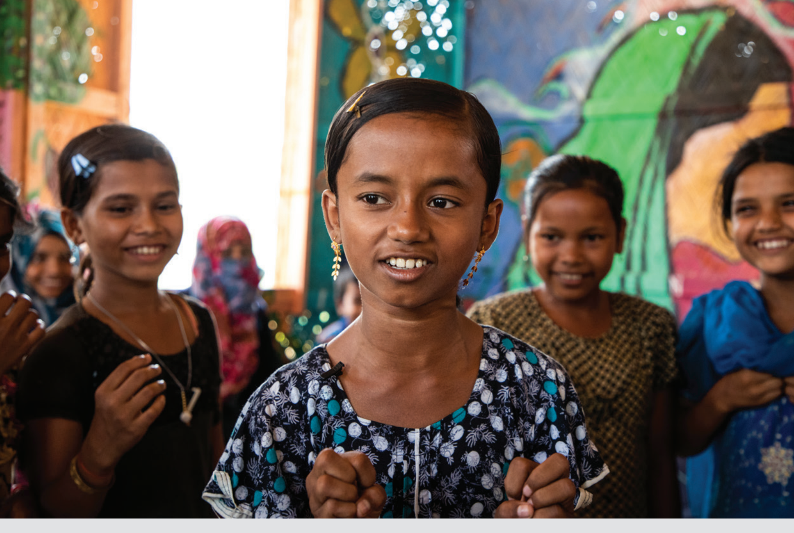
Bangladesh. Mental health project helps Rohingya youths discuss anxieties