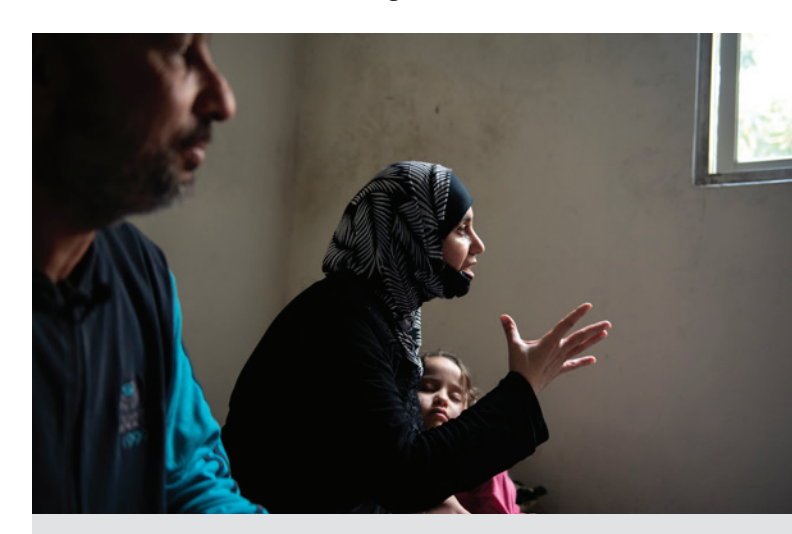
Lebanon. Ten years into Syria crisis, refugee family struggling with poverty and mental health issues

MHPSS is also relevant for other goals such as SDG 16 on Justice, Peace and Stronger Institutions.