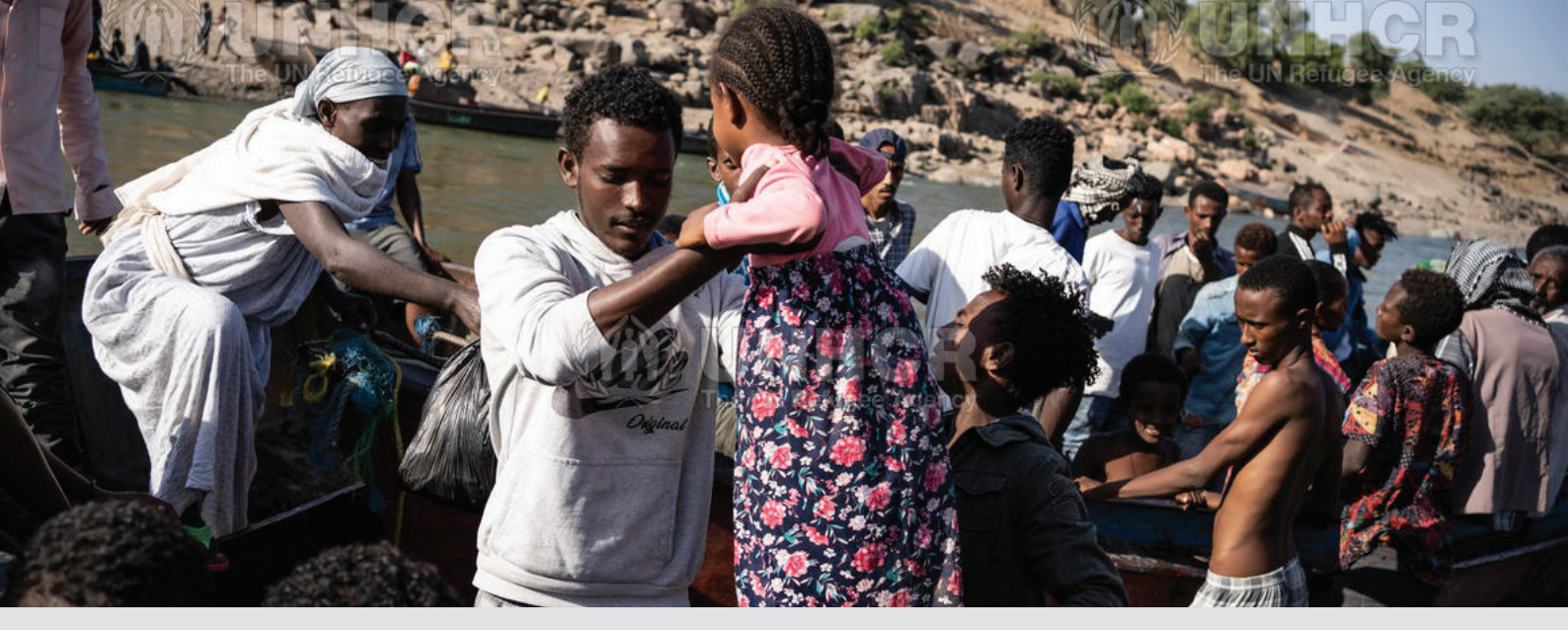
Sudan. Ethiopians flee to Sudan to take Shelter.