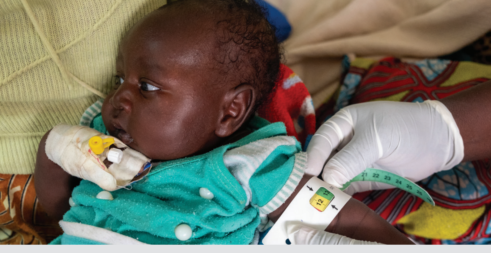
Kenya. Caring for refugee children on a Kakuma paediatric ward