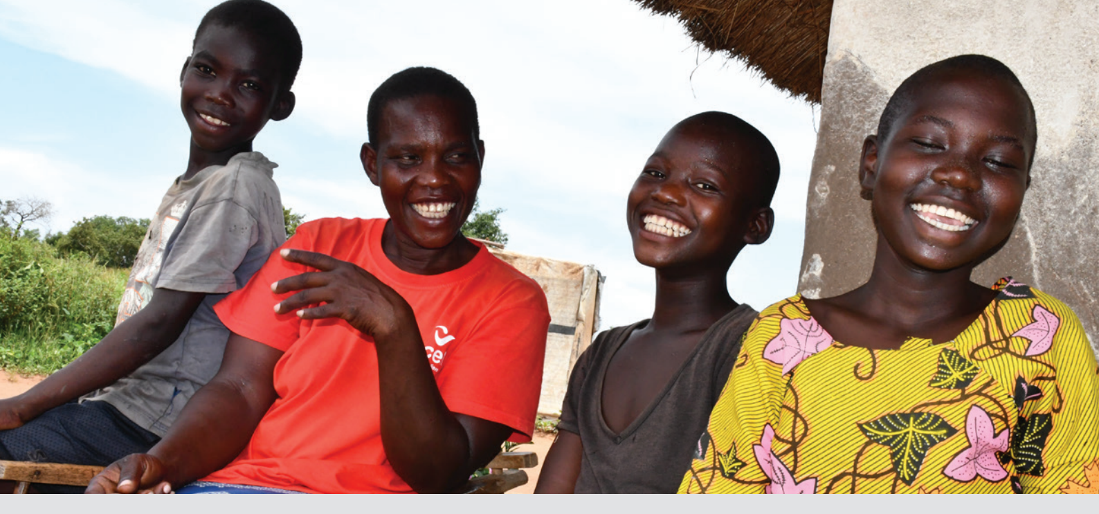
Uganda. Help is at hand for South Sudanese refugees living with HIV.

Services in the Context of COVID-19 and IAWG Programmatic Guidance for SRH in humanitarian and fragile settings during the COVID-19 pandemic