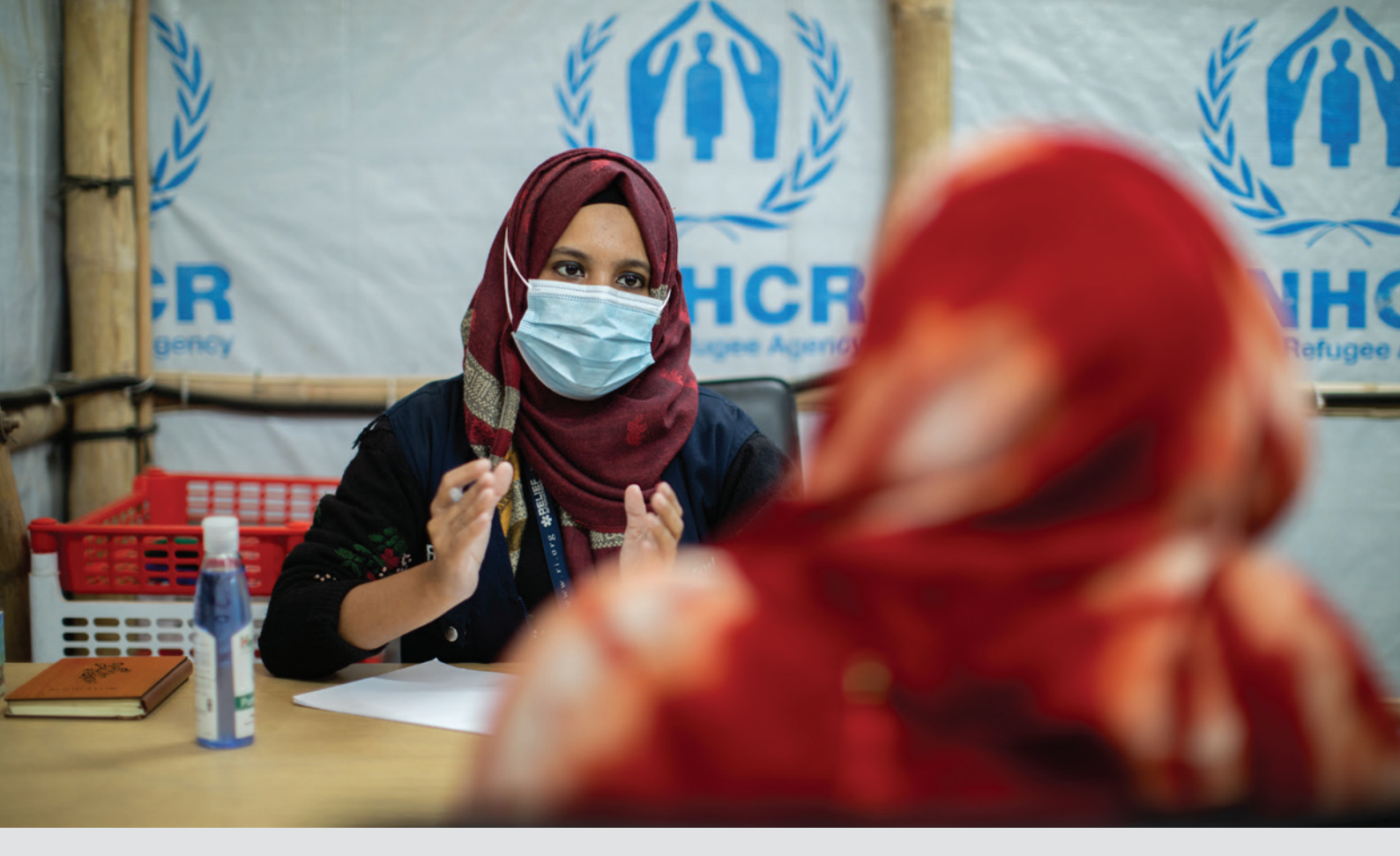
Bangladesh. UNHCR centres treat refugees and Bangladeshi Covid-19 patients