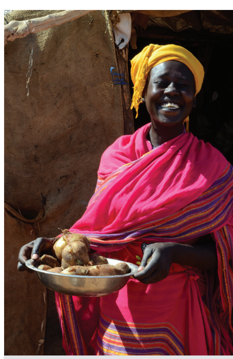
Sudan. Nivasha is one of several refugee settlements in the outskirts of the Sudanese capital Khartoum.

In 2019, of UNHCR's 77 refugee sites where acute malnutrition (wasting and nutritional oedema) was measured. 47 sites (61%) met the UNHCR standards of less than 10% Global Acute Malnutrition (GAM), while 10 sites (13.0%) showed GAM levels equal to or above the emergency threshold of 15%. Treatment options for acute malnutrition exist either through services provided in refugee camps