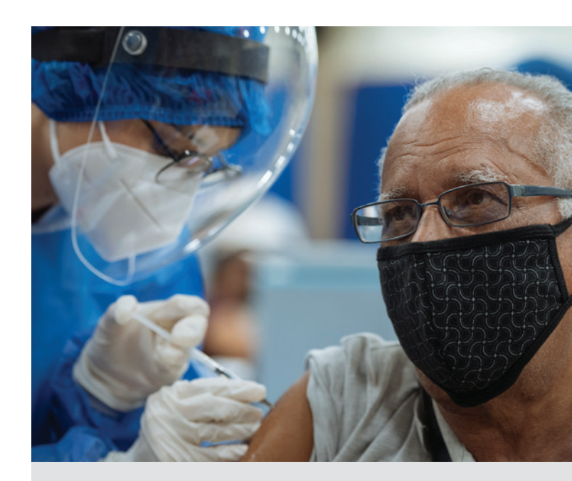
© UNHCR/Santiago Arcos Veintimilla Ecuador. Venezuelan refugee and migrant older people get the Covid-19 vaccine with UNHCR support

UNHCR will develop and leverage key strategic partnerships to ensure this support, including sufficient financing, is provided early in the response and is sustained over time. Many refugee hosting countries have health systems that need strengthening especially in remote areas where refugees are often hosted. They may already have health sector reform or development plans supported by external donors. These will be generally too slow to respond adequately to emergency health needs and additional support will be needed especially early in the response.