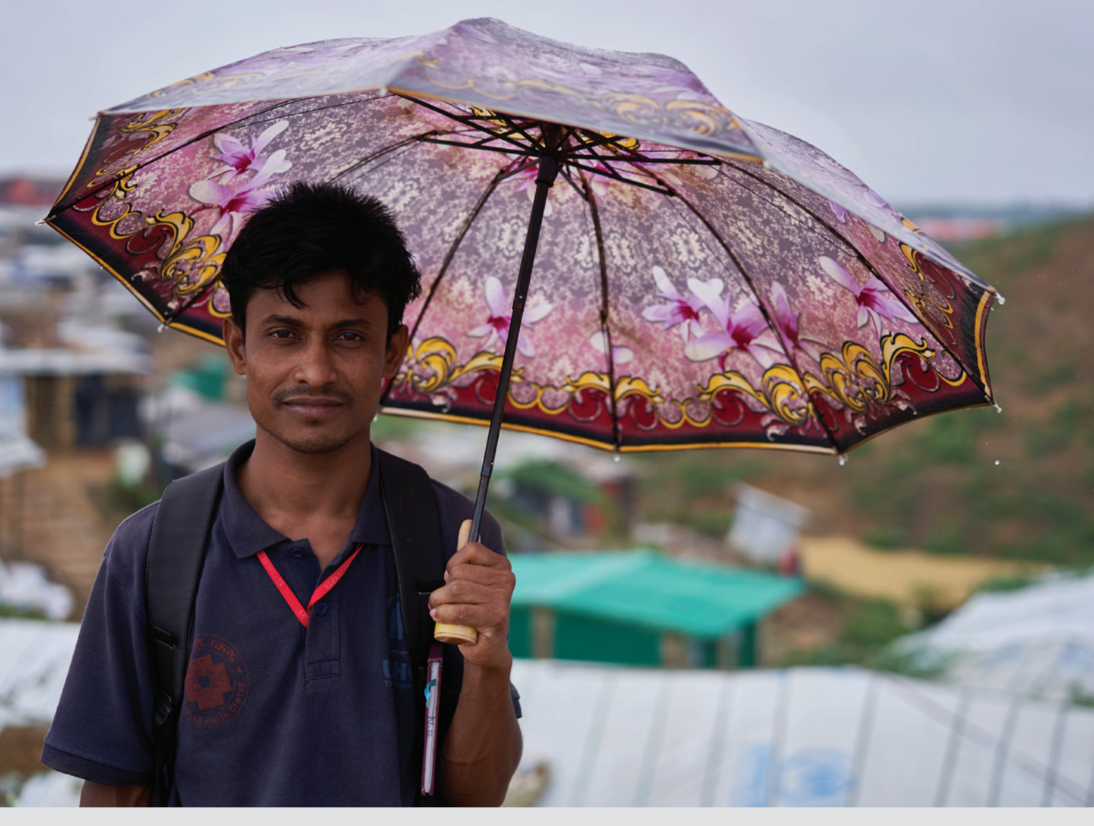
Bangladesh. Community health worker undertakes household visits

Result 2: Refugee communities are engaged in and benefit from a strong community health approach adapted to the context (urban, rural dispersed, camp settings, low and middle-income settings)