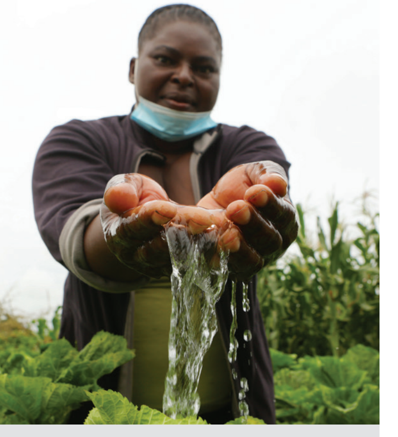
Zimbabwe. Improving water access at Tongogara refugee camp