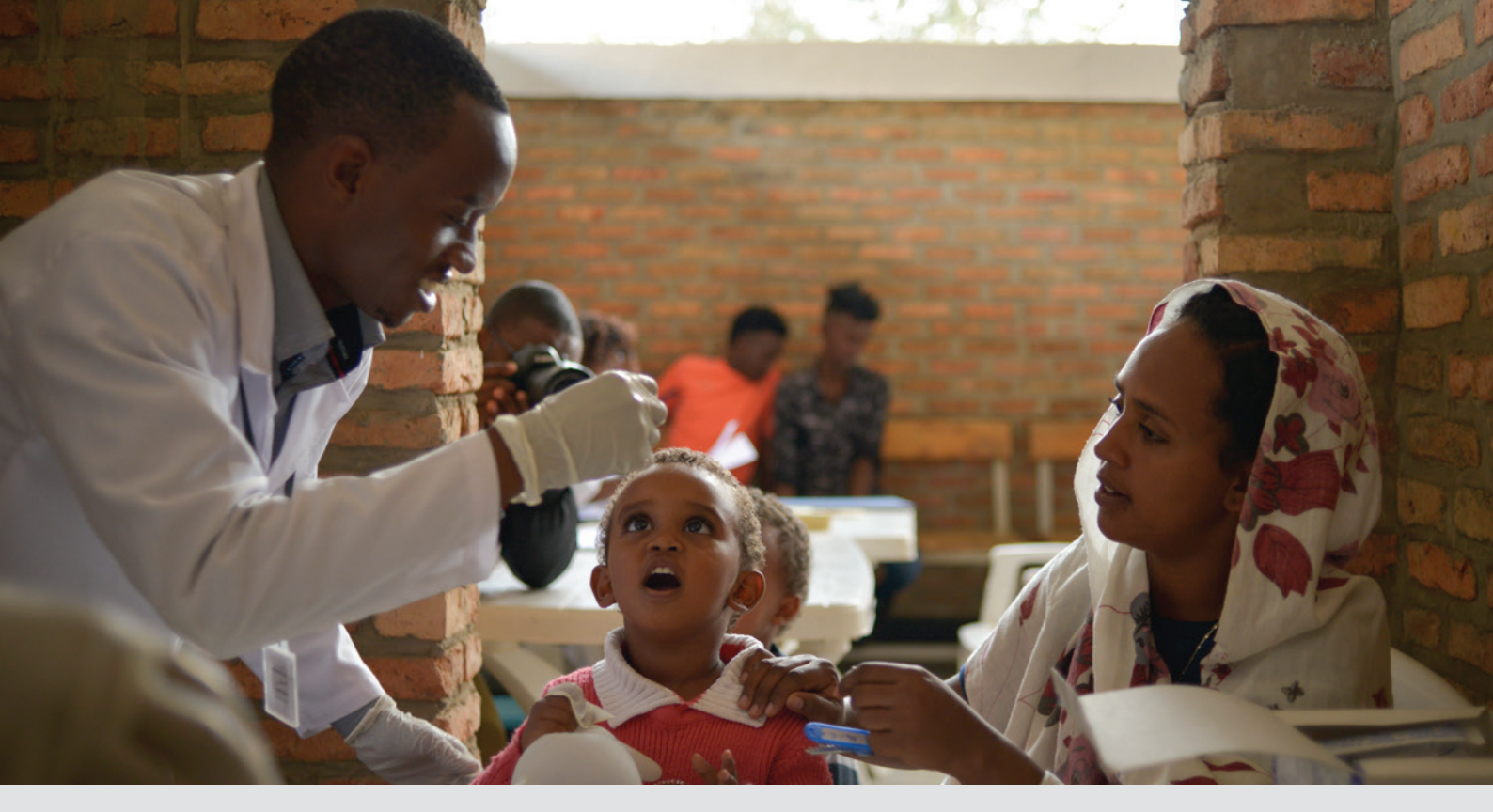
Rwanda. First group of evacuees from Libya arrive in Gashora

During emergency situations, Sphere standards and generally accepted emergency mortality and nutrition thresholds are key in monitoring the response. Once the situation stabilizes health programming targets will be guided by national standards, while increasingly harmonizing these around SDG Goals and Agenda 2030 targets, combined with measuring indicators for UHC 2030. It is important that every public health response consists of a timely set of actions, decisions, and interventions so that the relevant actions are undertaken in the different phases of a refugee emergency. The UNHCR Public Health in Emergencies Toolkit<sup>10</sup> provides guidance and tools that can be adapted to different contexts.