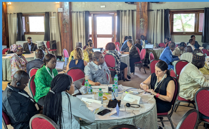
Participants during the Session on Data on Internal Displacement

The forum underscored the critical need for direct engagement with governments to foster national and local ownership in addressing internal displacement. The way forward requires a collaborative approach that prioritizes the voices of IDPs, incorporates local experiences, and strengthens the commitment to ending arbitrary displacement. For more information, please refer to the summary report ( English and French ) and listen to the reflections of participants . Post-forum, a virtual Member states briefing was held to allow facilitators and participants to share their reflections and key takeaways.