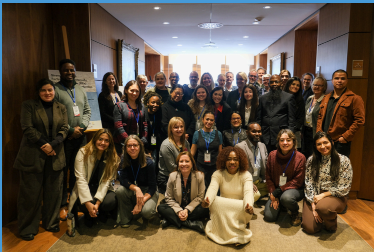
Participants of the workshop on Strengthening the Participation of IDPs in Montreal, December 2024

A total of 40 participants included IDP leaders, IPEG members, experts from UN agencies and NGOs, key academics and students ( see the list of participants here ). Ten IDP Leaders from Colombia, Ethiopia, Honduras, Iraq, Nigeria, and Ukraine shared their experiences and recommendations regarding participation in the response and solutions for their displacement.