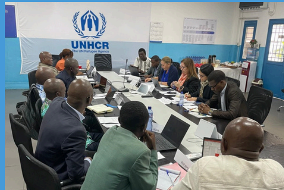
IPEG delegation meets with DRC government officials from key ministries in Kinshasa