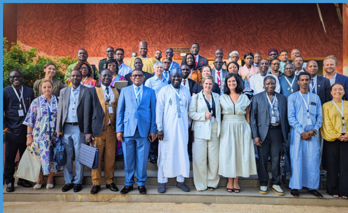
Participants and facilitators of the Cross-Regional Forum