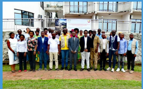
Attendees at the café de presse, 12 December