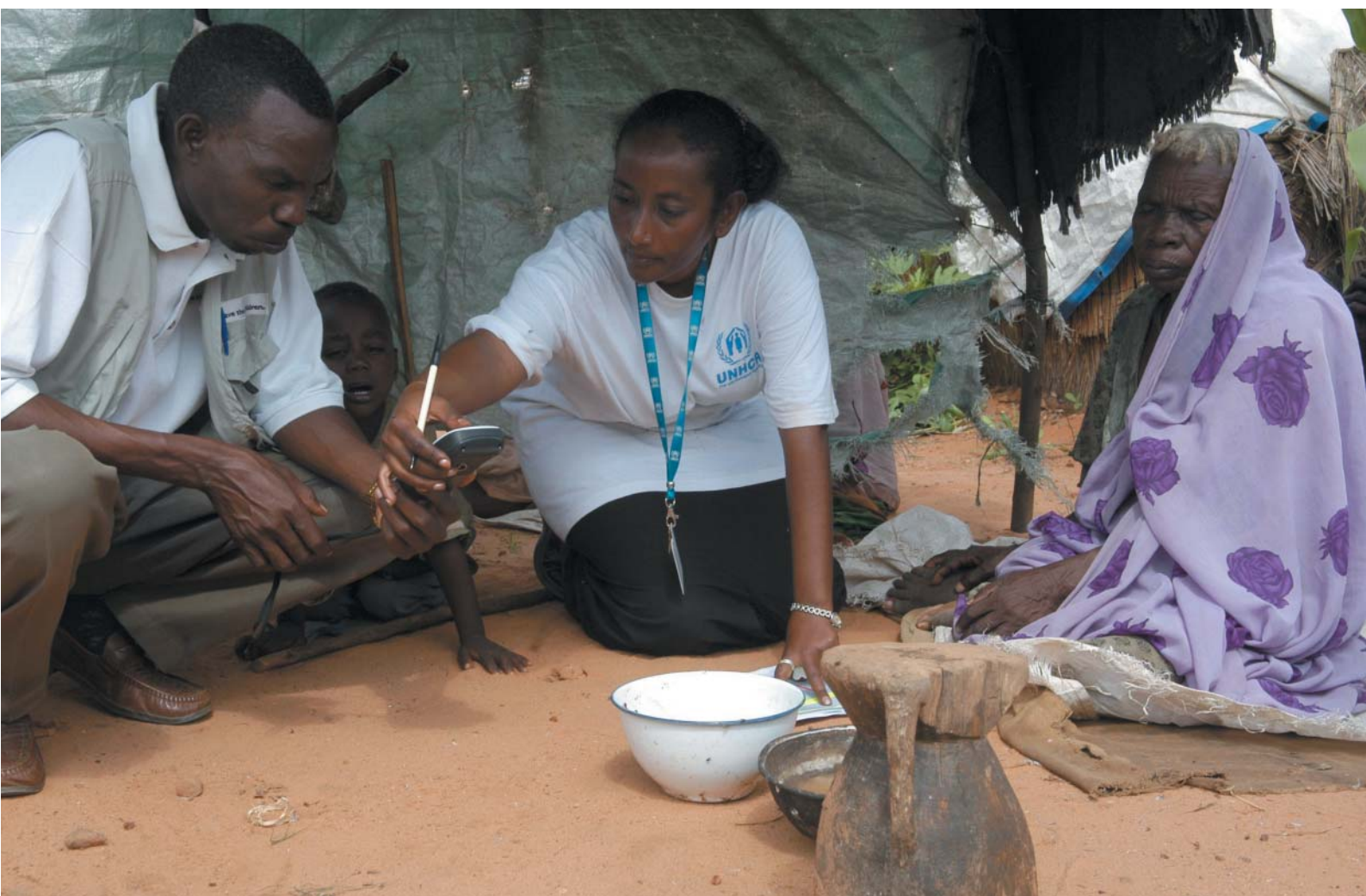
West Darfur, Sudan. By using GPS technology UNHCR can map out the location of vulnerable displaced people and thus ensure that they are protected and assisted.

UNHCR's country operations for Chad and Sudan are described in detail in the following country chapters.