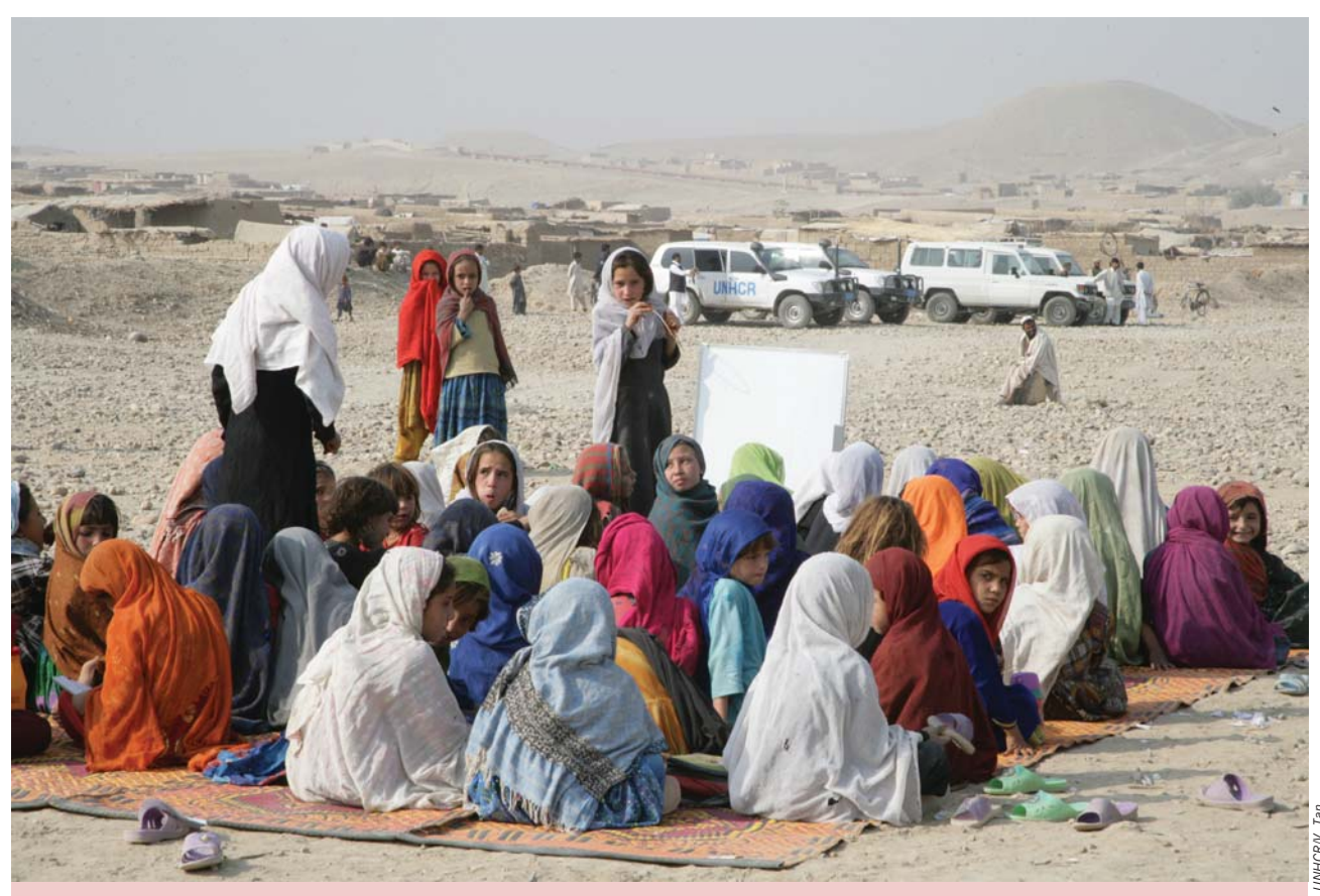
Returnee children in a makeshift school in Sheikh Mesri.

of 1,200 households that returned in 2007, only about half remained in their place of origin. Border monitoring indicated that many returnees from 2007 went back to their former asylum country.