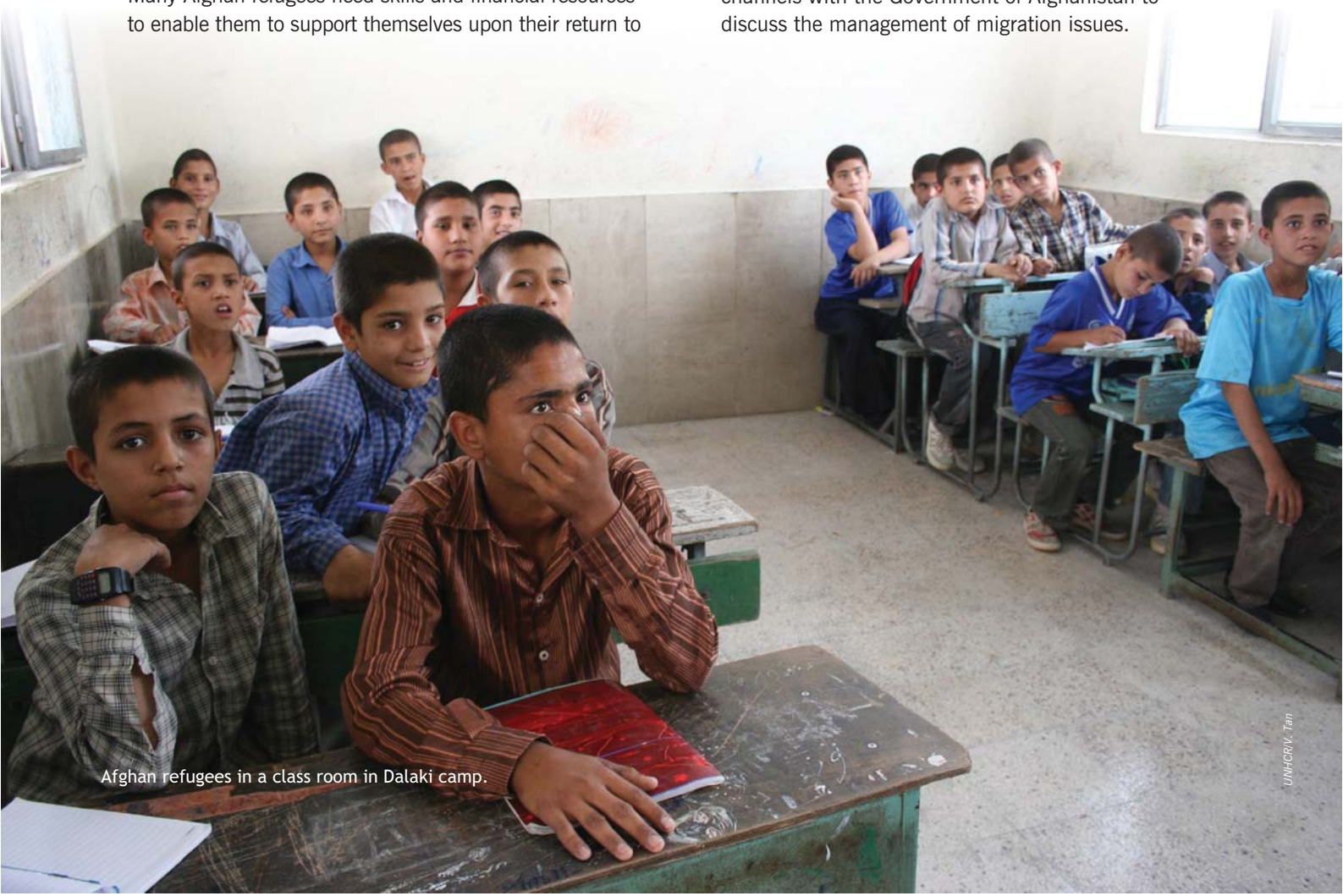
Afghan refugees in a class room in Dalaki camp.