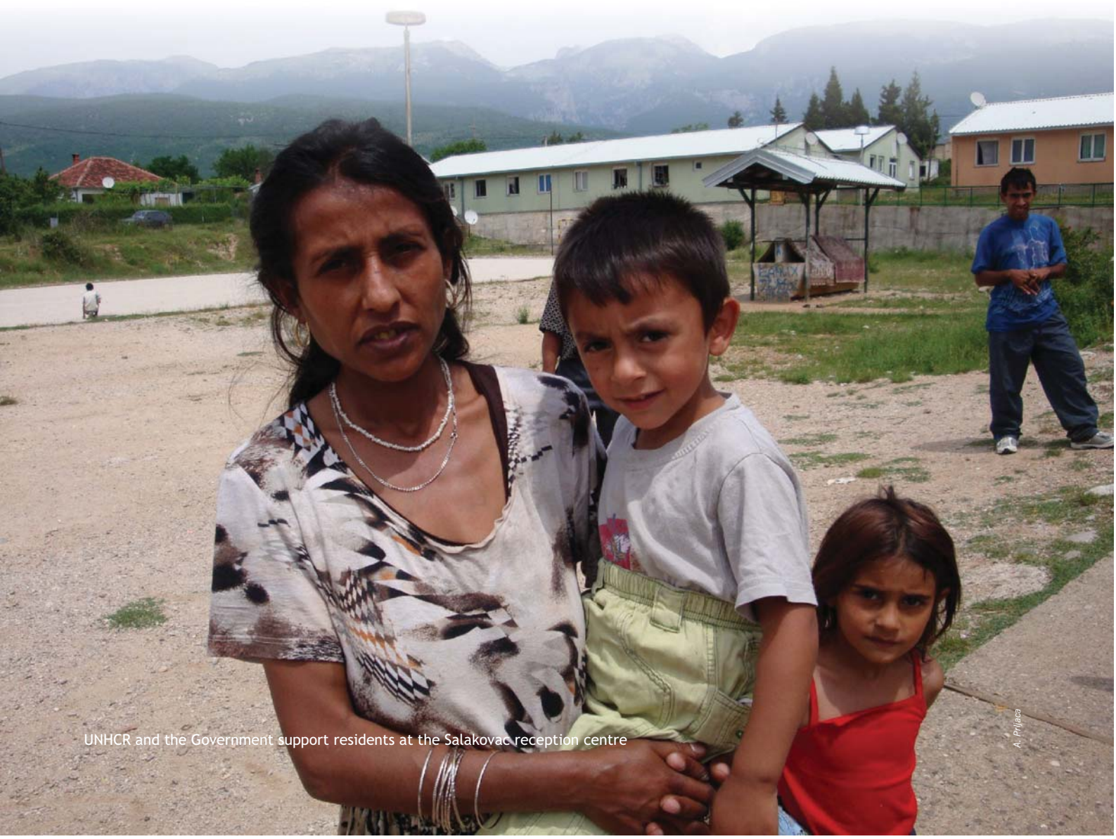
UNHCR and the Government support residents at the Salakovac reception centre