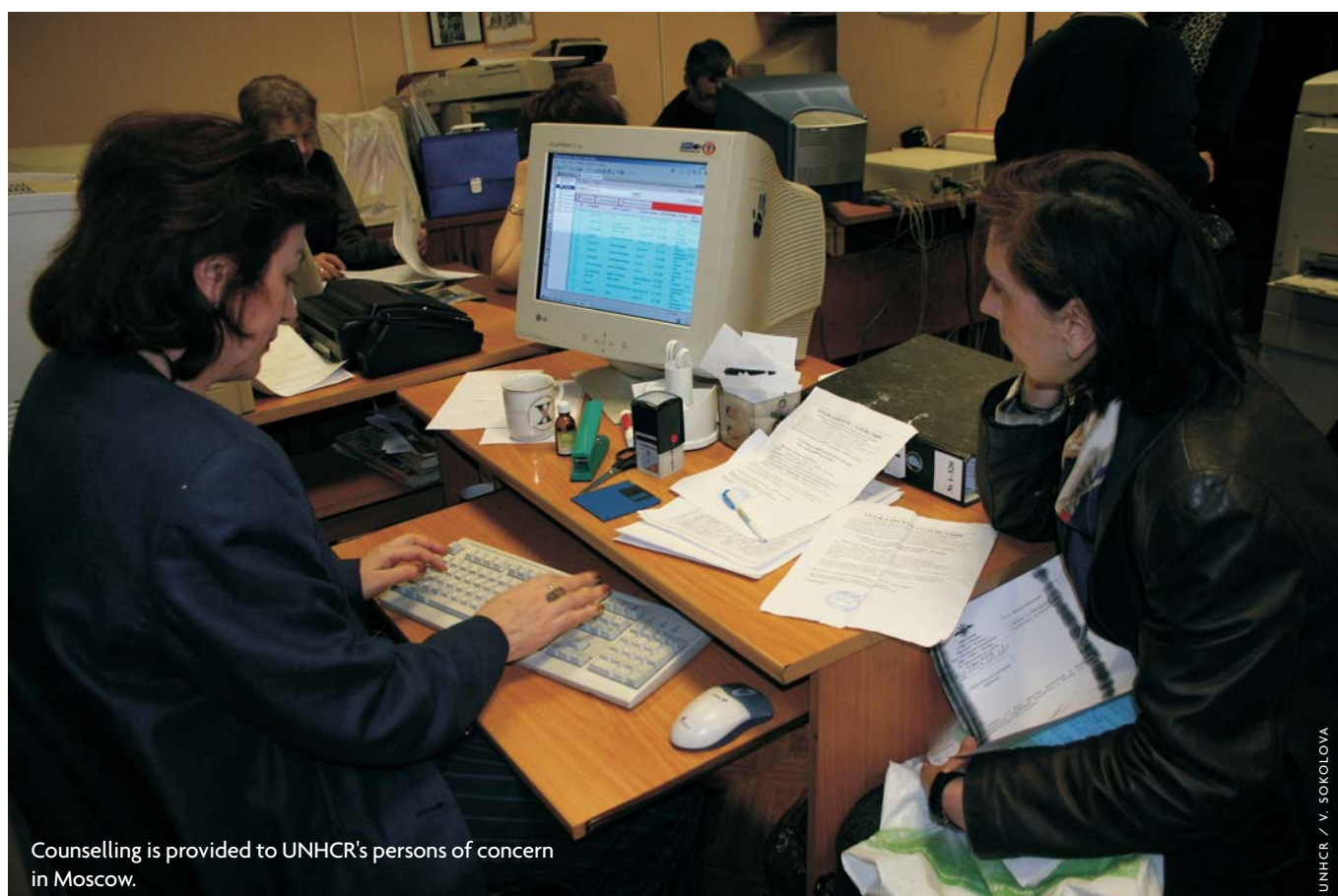
Counselling is provided to UNHCR's persons of concern in Moscow.