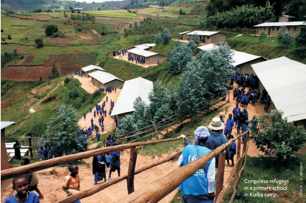
Congolese refugees in a primary school in Kiziba camp.